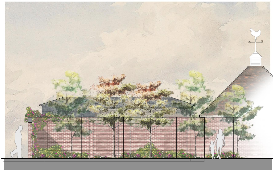
North Elevation as Proposed 1:100