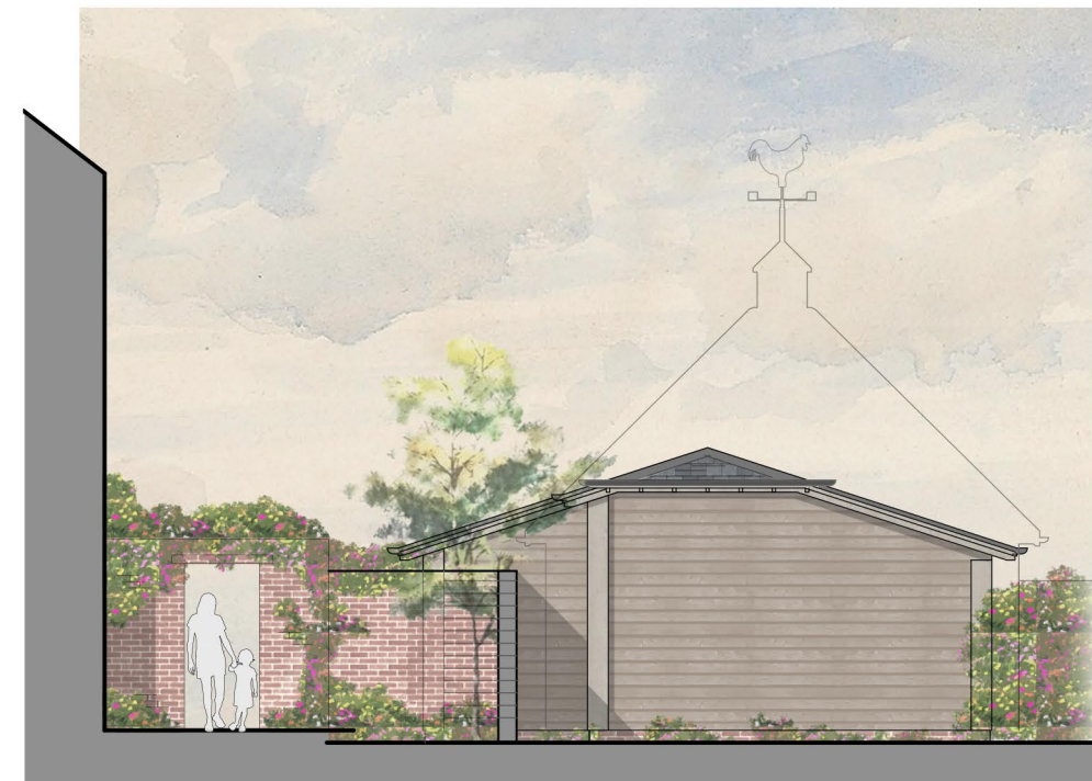
West Elevation as Proposed 1:100

Proposed Listed Building Application Peirce House, The High Street, Charing, TN27 0HU Existing and Proposed Outbuilding North and West Elevations