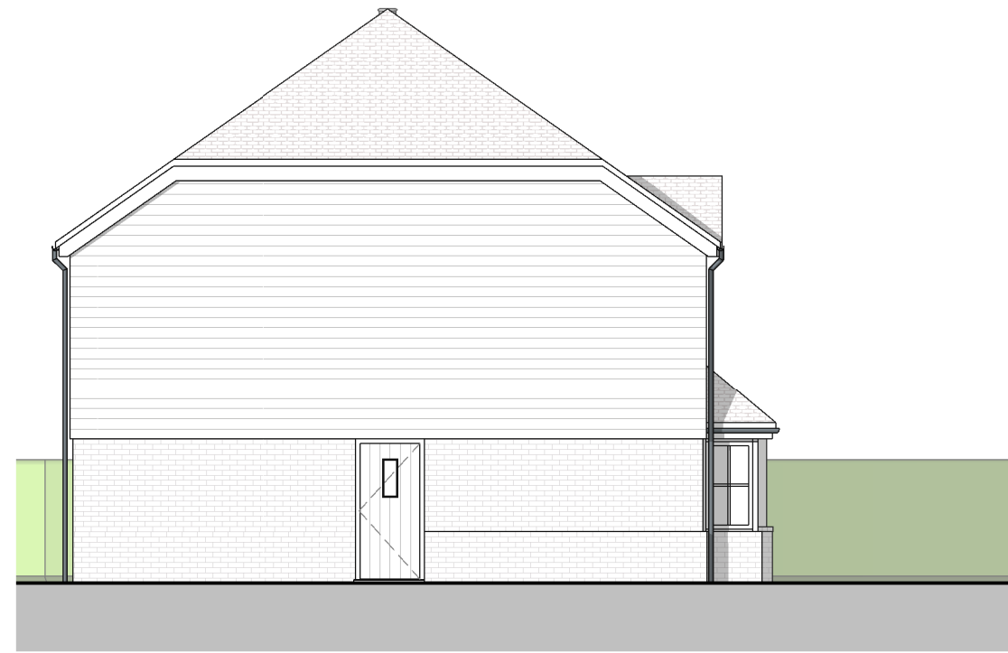
Proposed Side Elevation North West 1:100