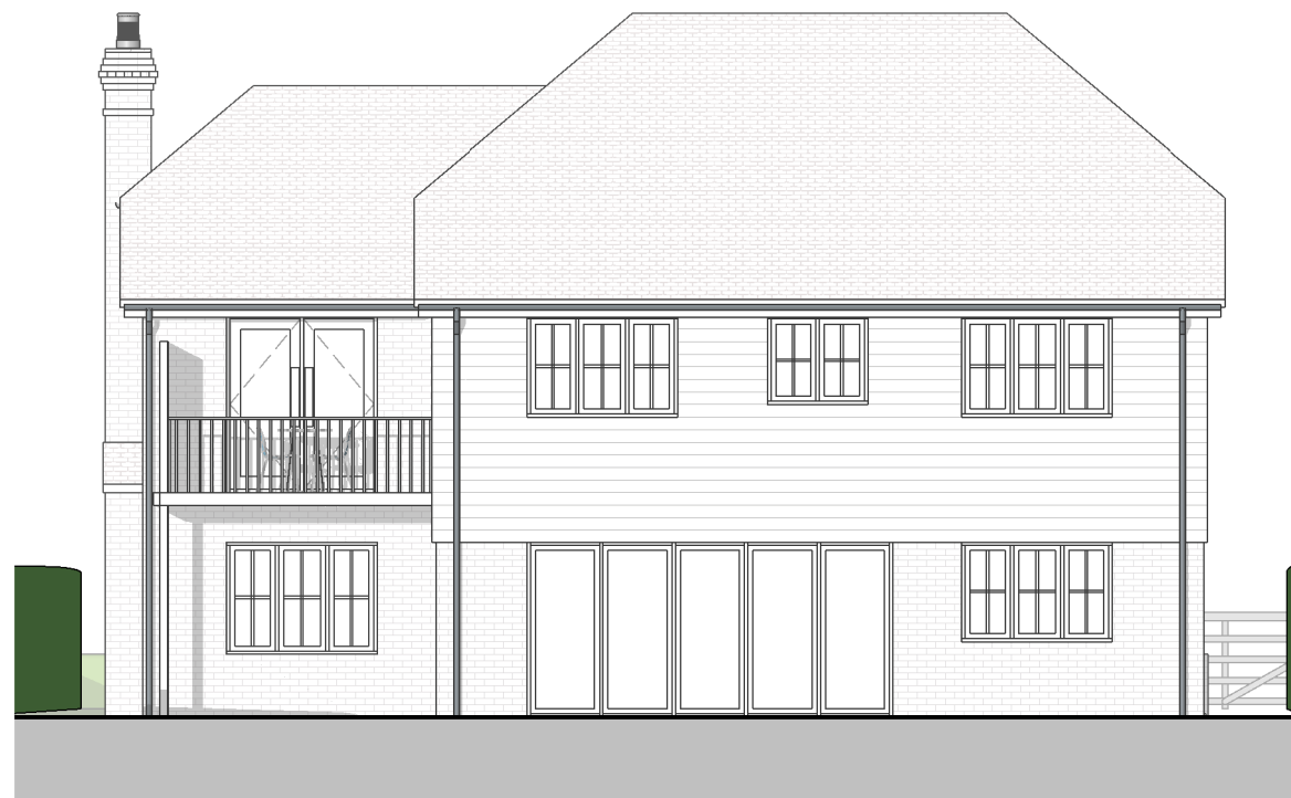
Proposed - Rear Elevation 1:100