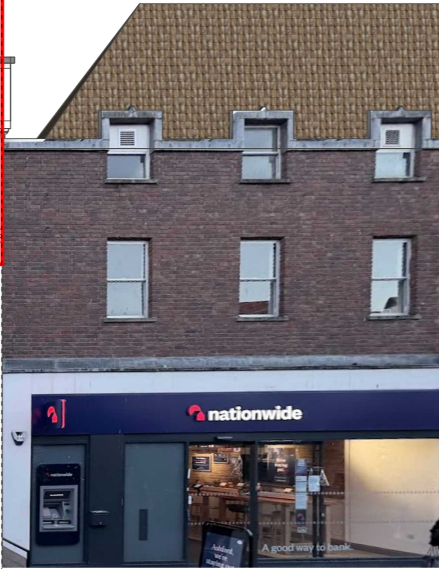
93 HIGH STREET