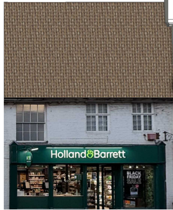
87 HIGH STREET