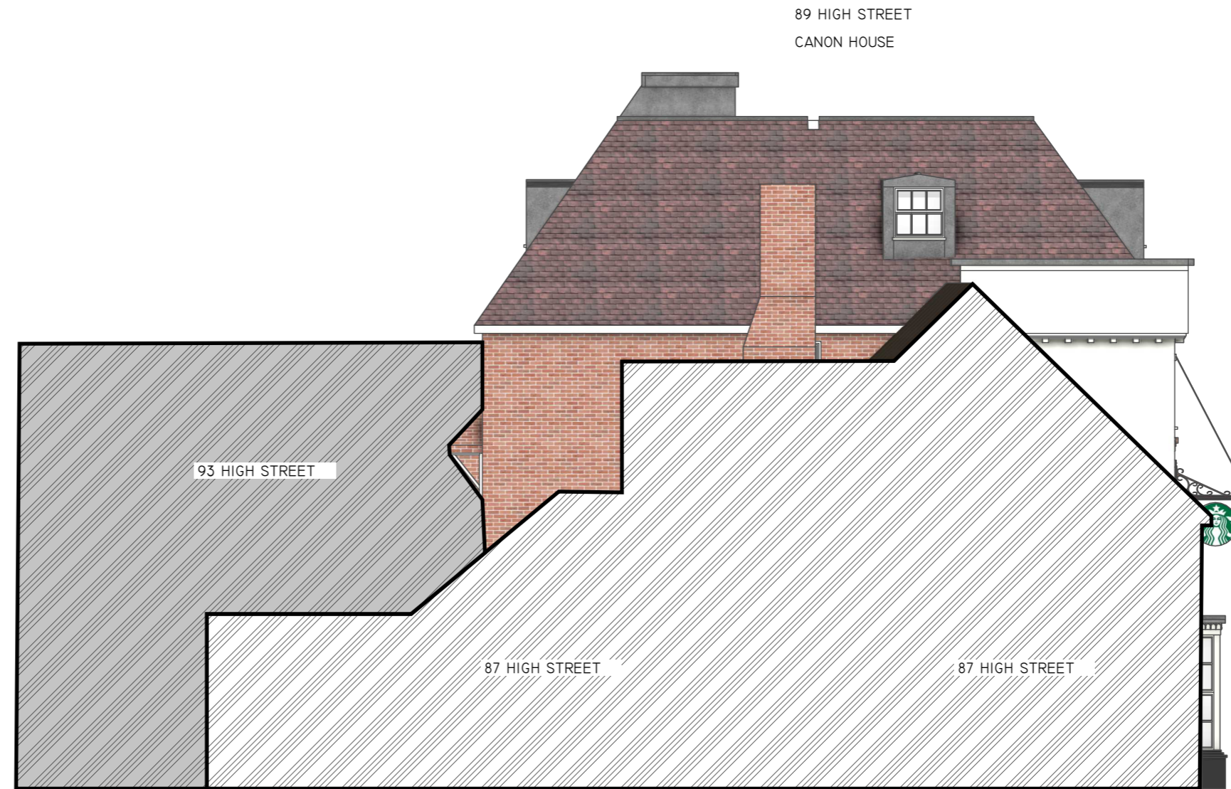
89 HIGH STREET CANON HOUSE