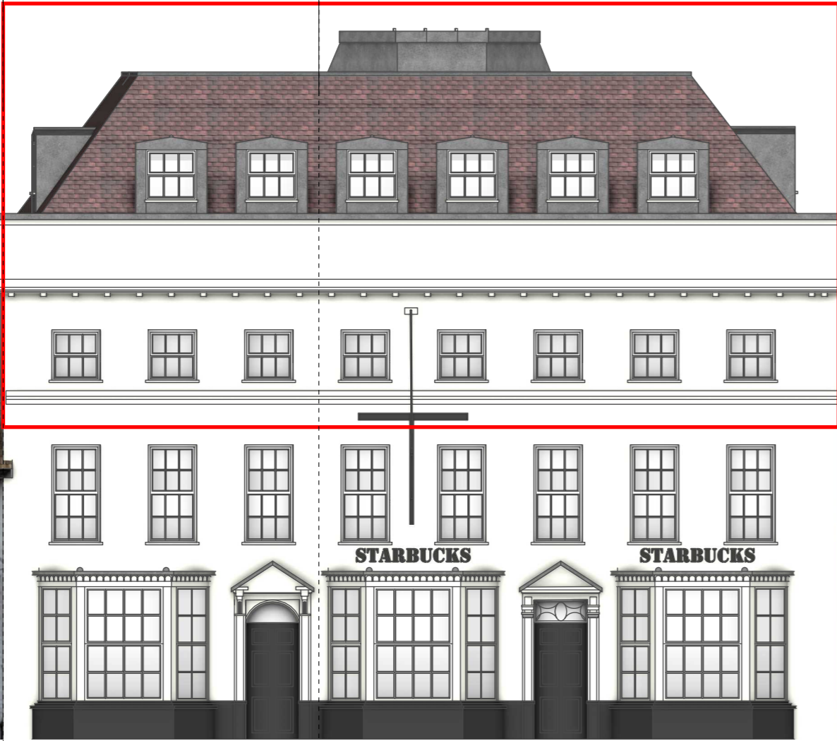
89 HIGH STREET CANON HOUSE