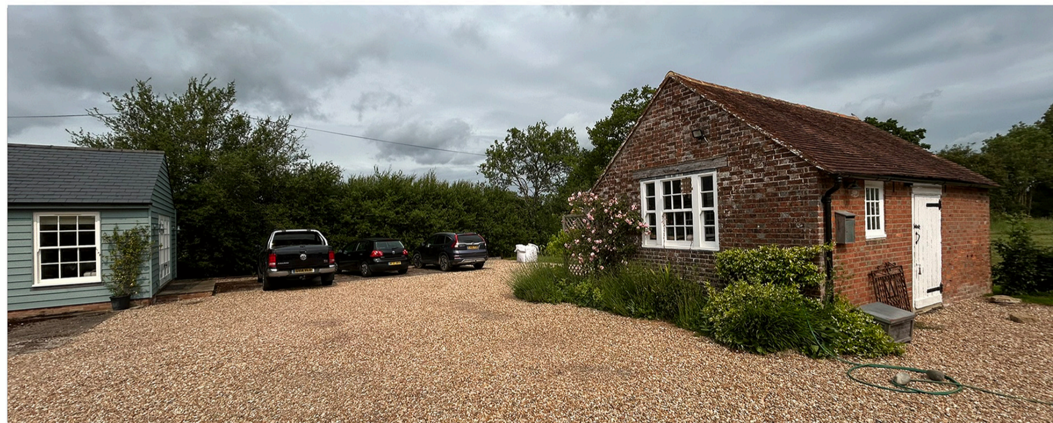
Photo 2 - The potting shed viewed from the drive