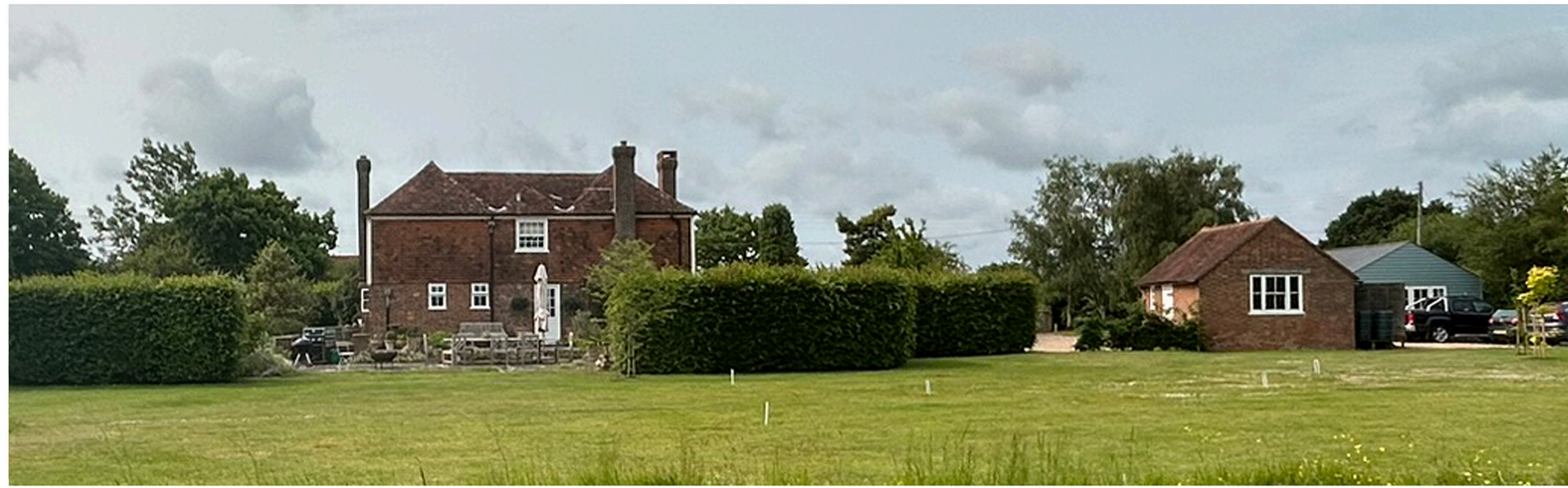
Photo 1 - Long view taken across the field from the North