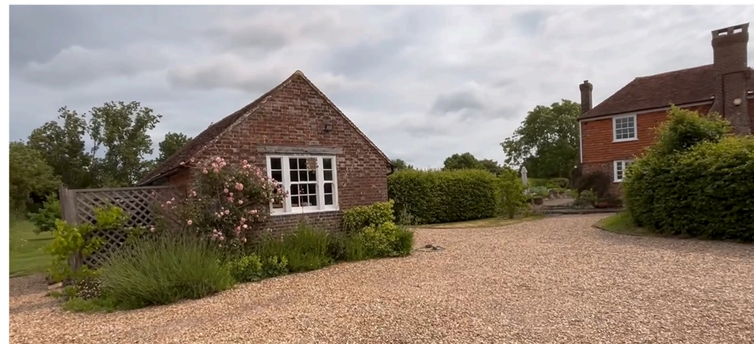
Photo 5 - The potting shed in context of the house. The boiler flue would be hidden from view.