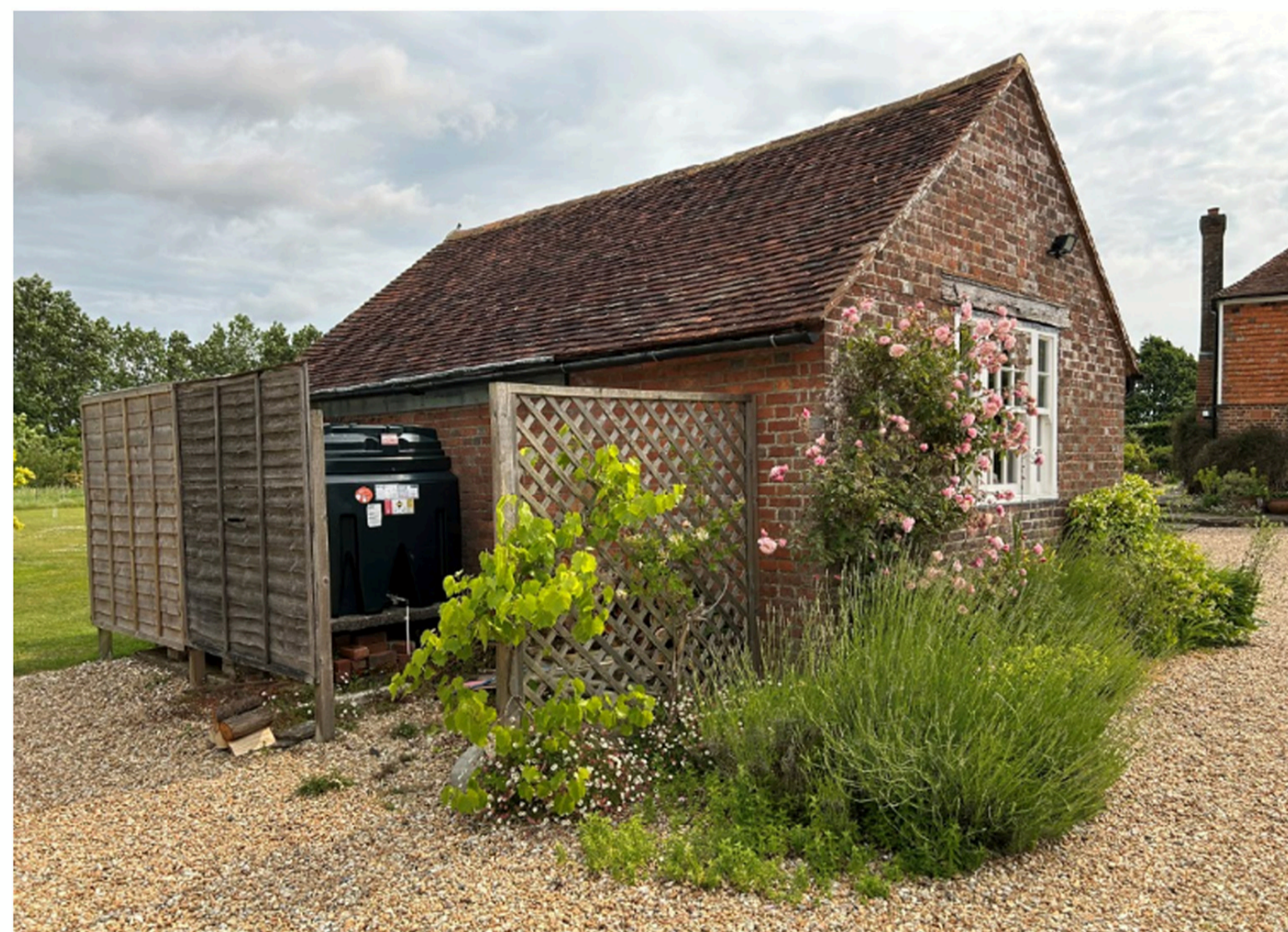
Photo 4 - South Westerly view of the Potting Shed with existing oil tank enclosure. Notably, The Wall mounted flue to the oil boiler will be located within this enclosure and thereby hidden from view.