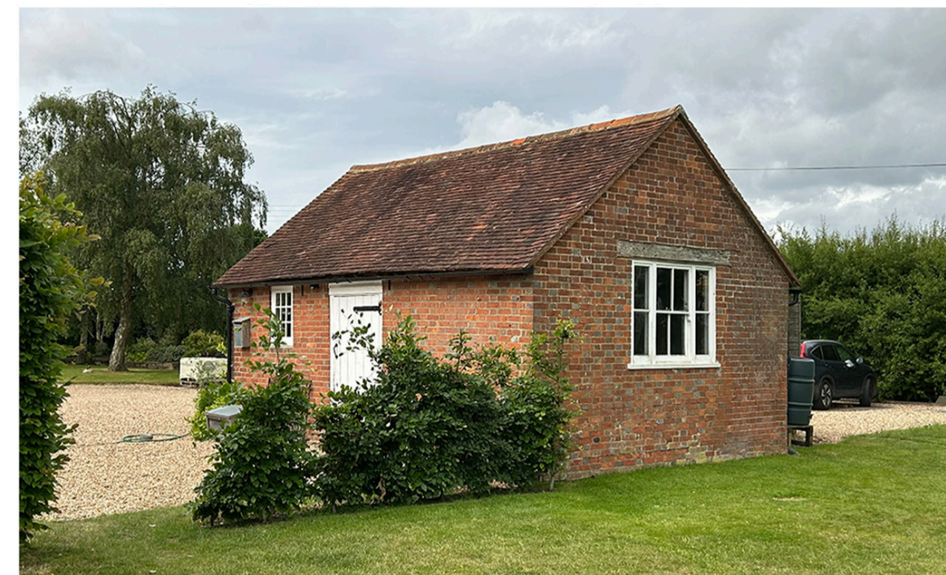
Photo 3 - North-Easterly view of the potting shed