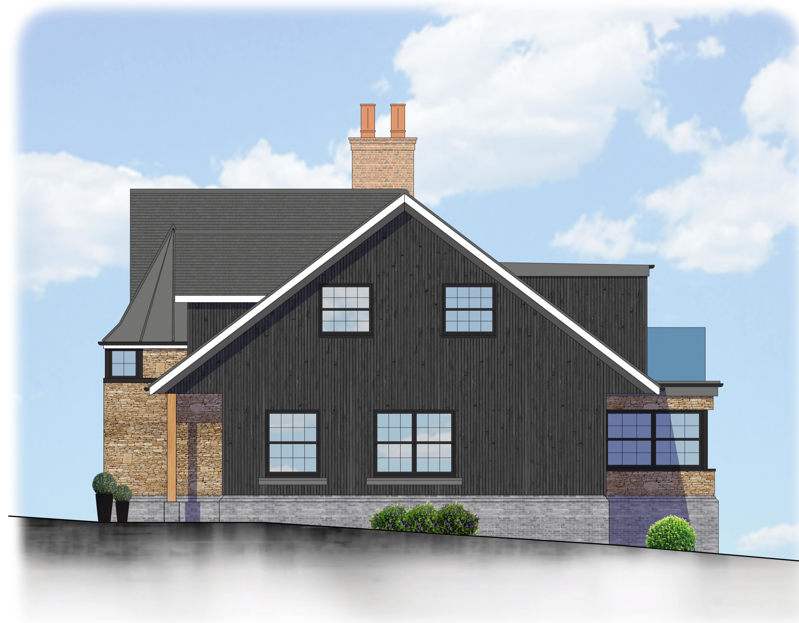
side - east