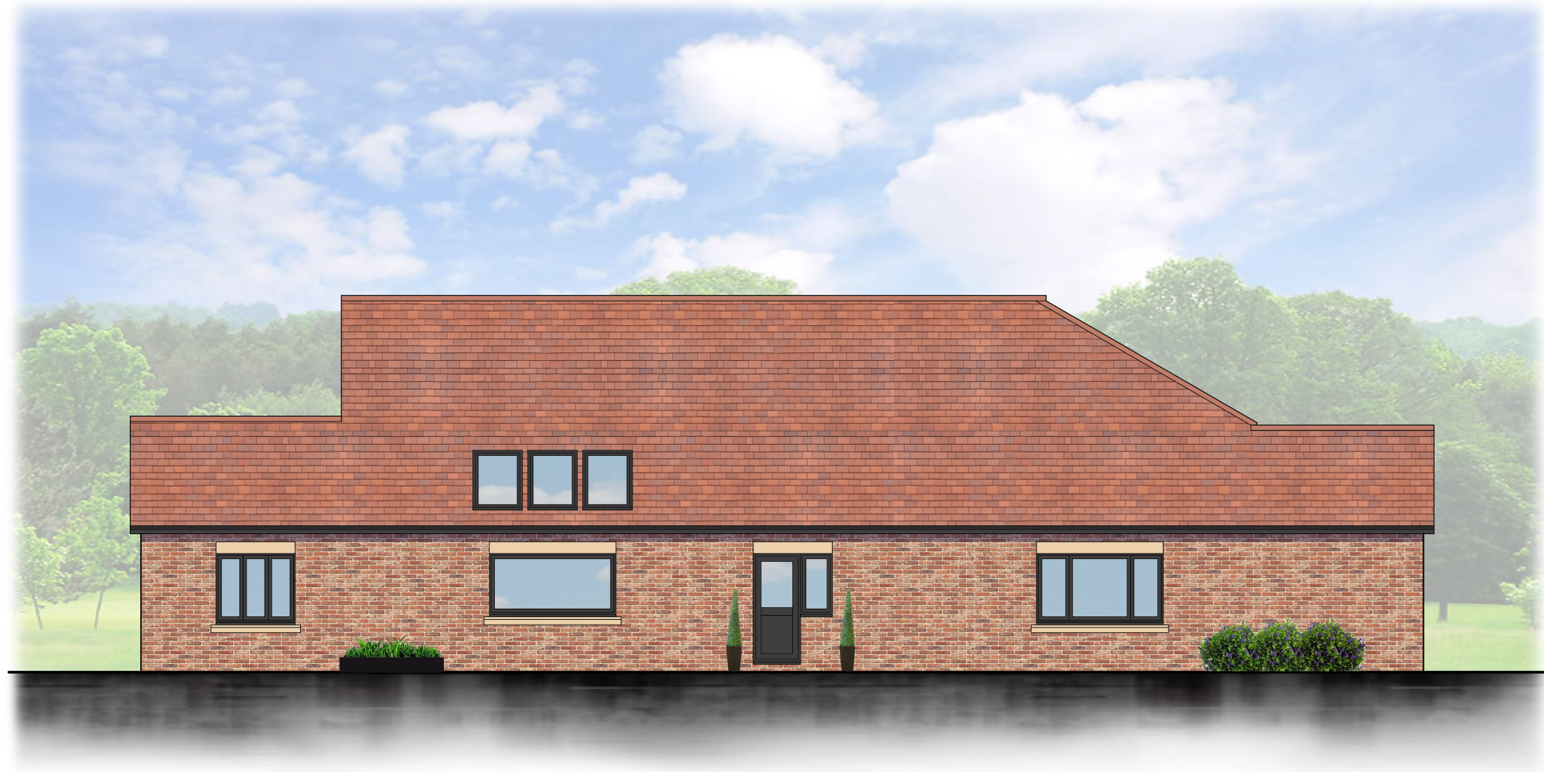
side - north east