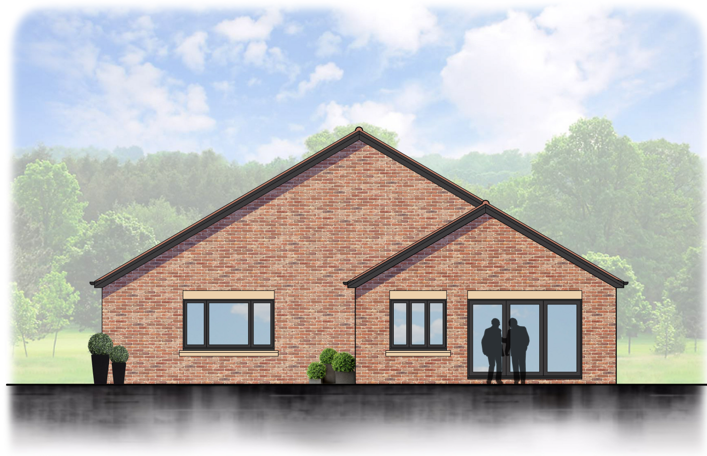
rear - south east