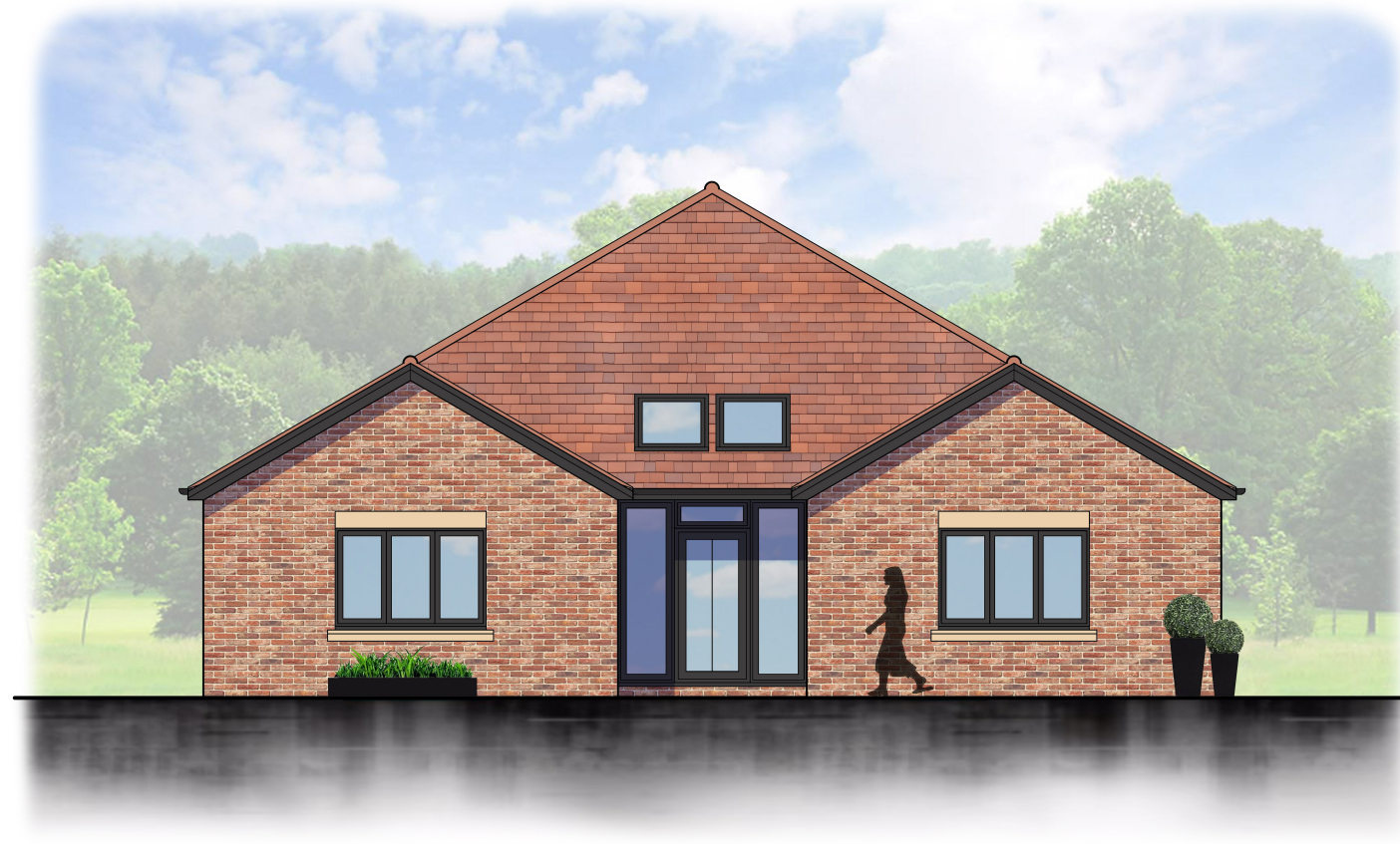
front - north west