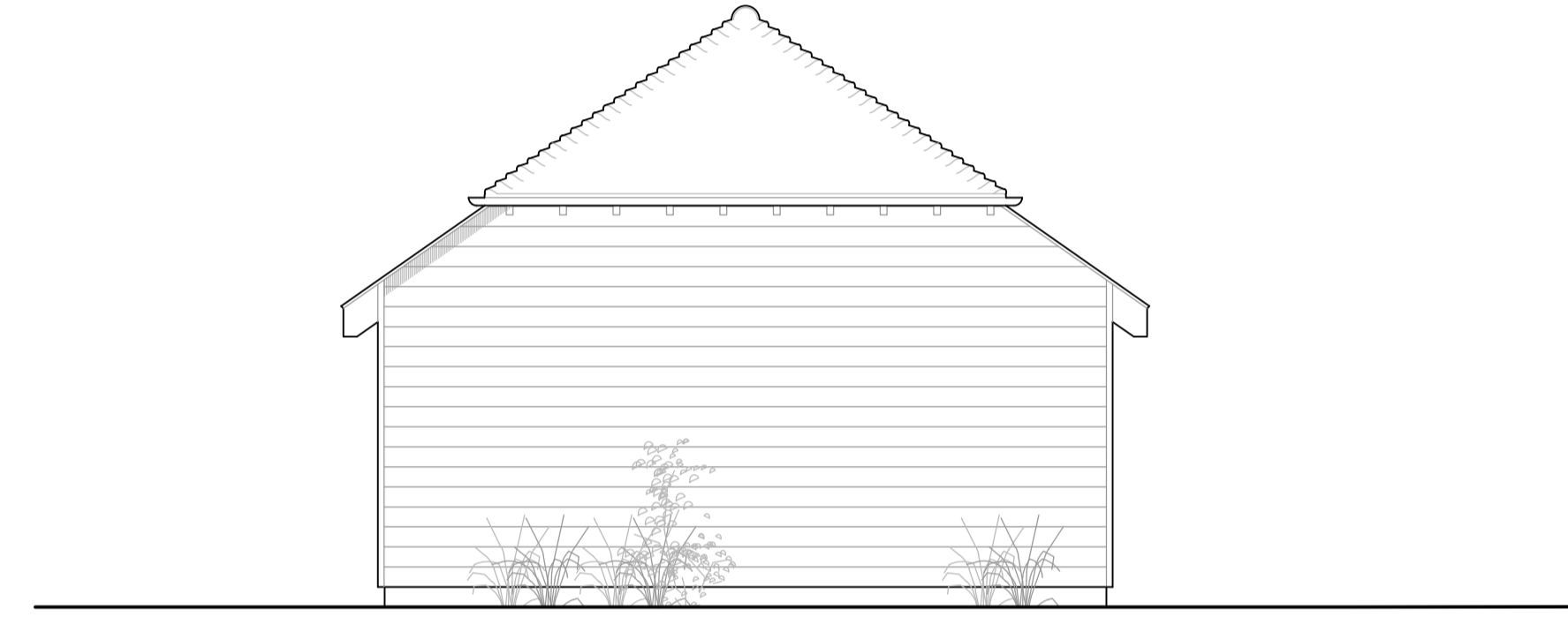
PROPOSED WEST ELEVATION Scale 1:50