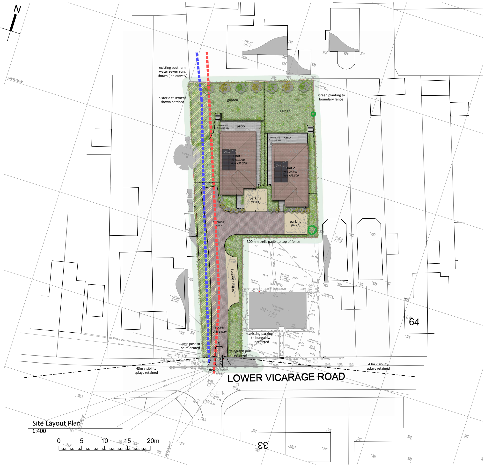
Site Layout Plan 1:400