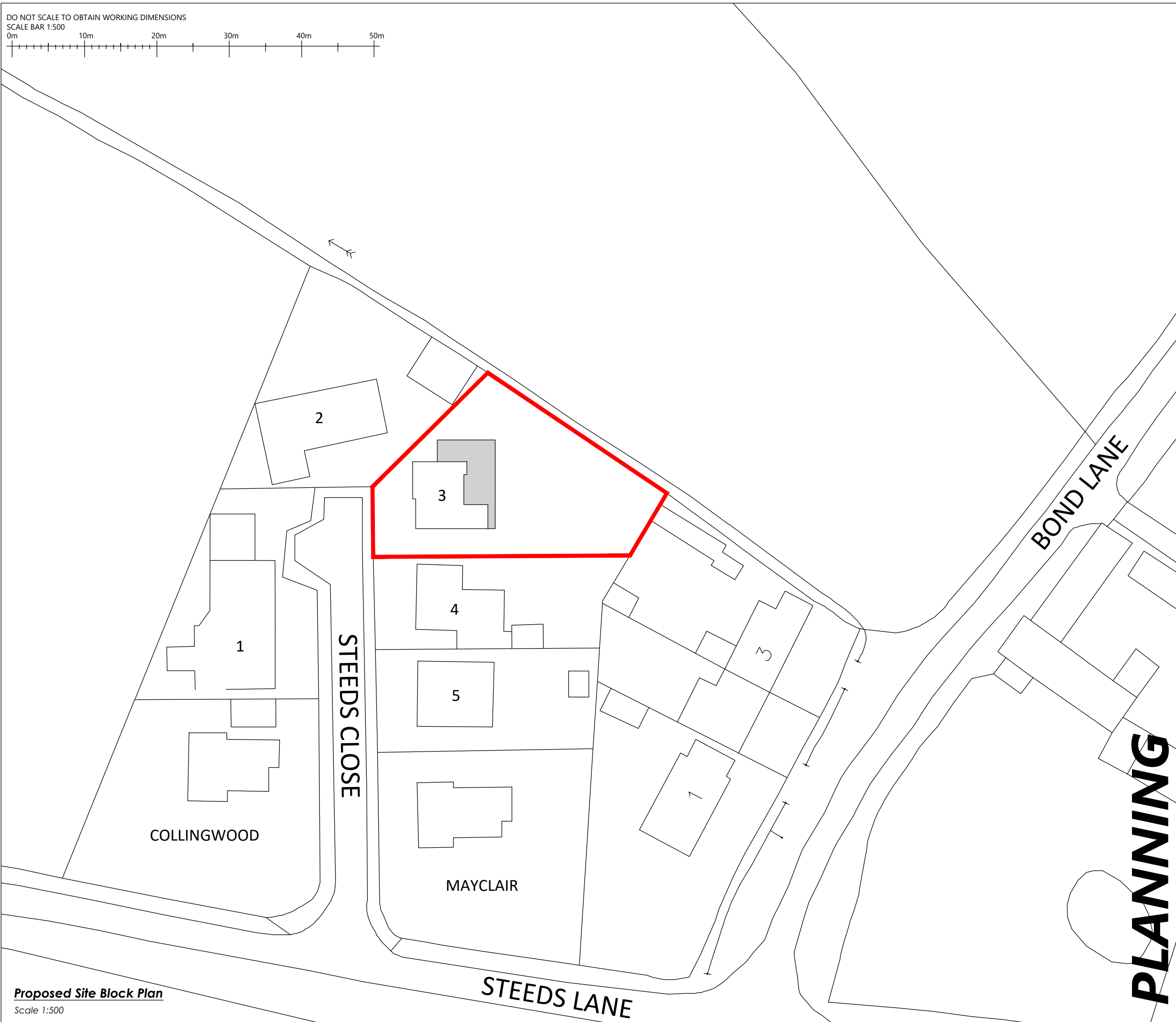
Proposed Site Block Plan Scale 1:500

DO NOT SCALE TO OBTAIN WORKING DIMENSIONS SCALE BAR 1:500 0m 10m 20m 30m 40m 50m