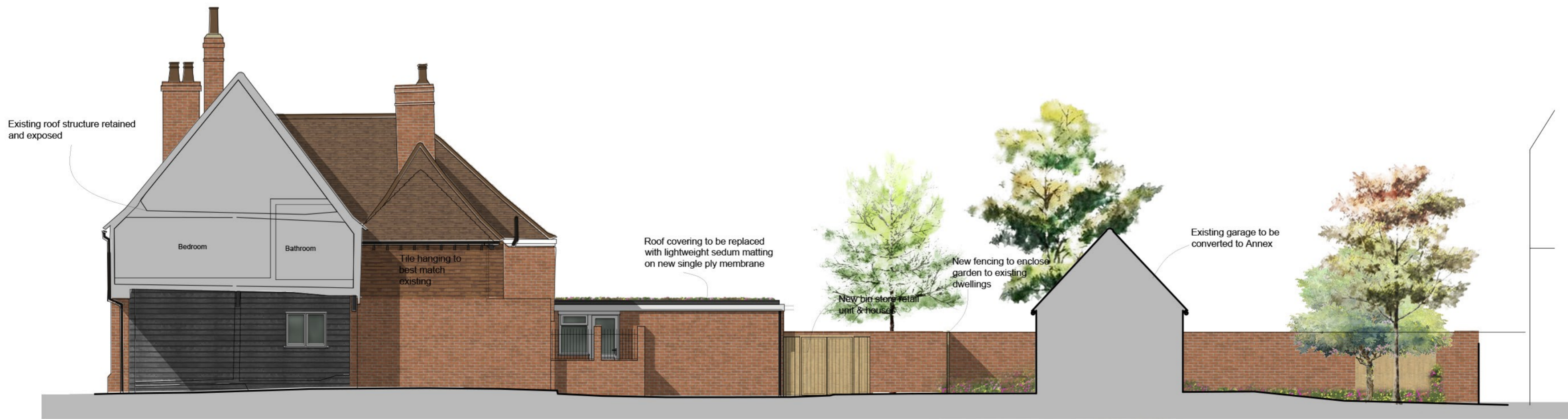
North Elevation as Proposed 1:100