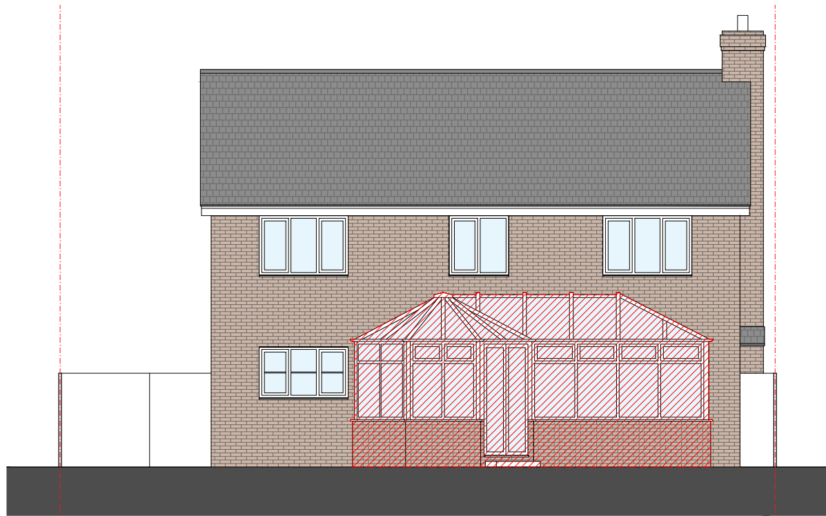
PRE-DEVELOPMENT NORTH-EAST ELEVATION SCALE: 1:100 @ A3