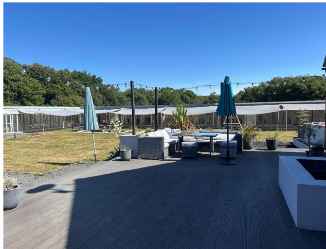
Rear garden – view towards cattery