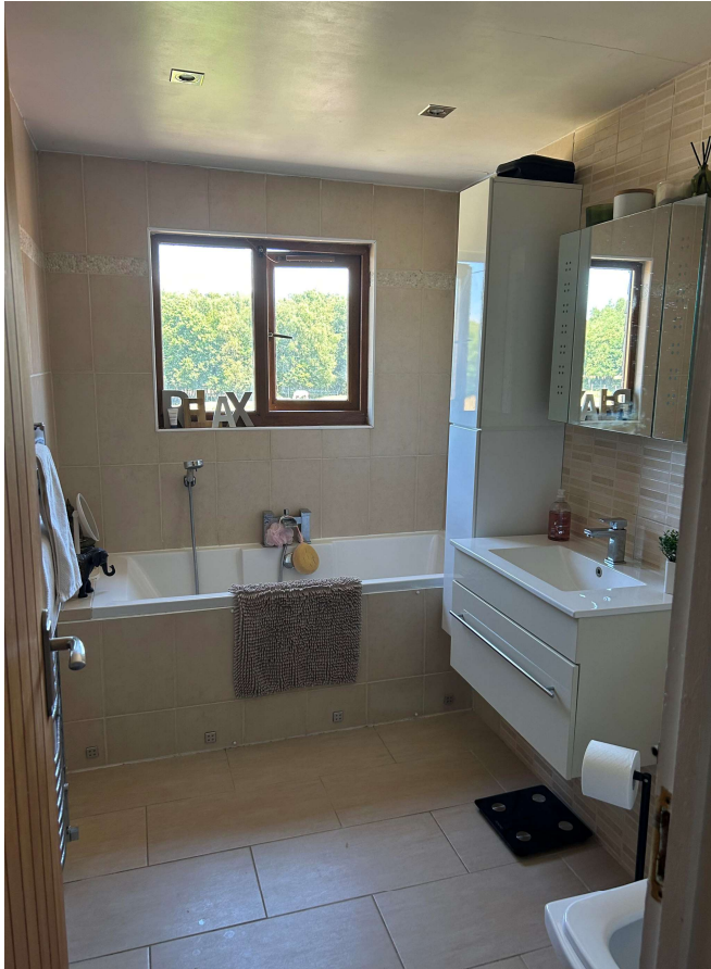
First floor bathroom