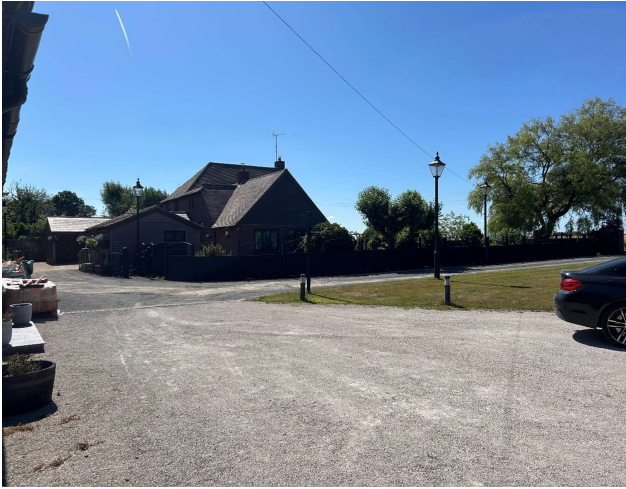
Ranpura - opposite