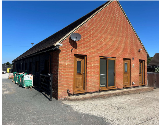
Pool building – east elevation