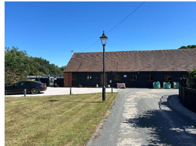
Drive / front elevation / parking