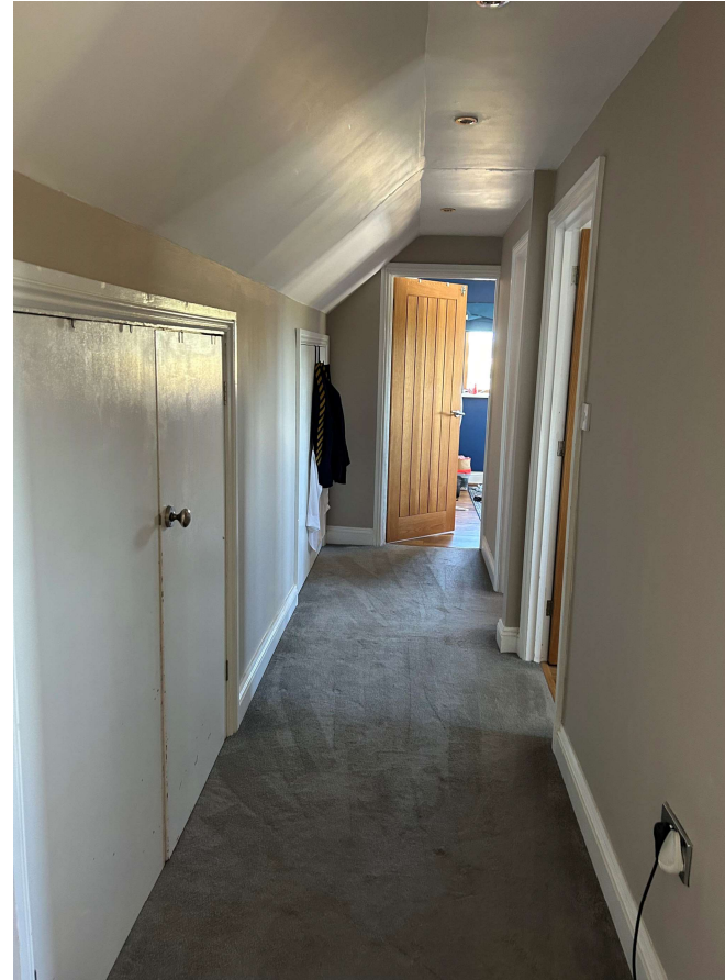
First floor hallway