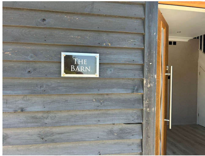
Front house sign