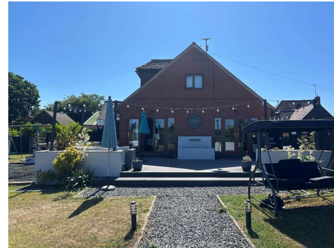
Rear garden – west elevation