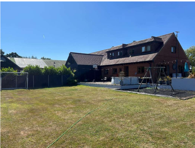
Rear garden – rear elevation