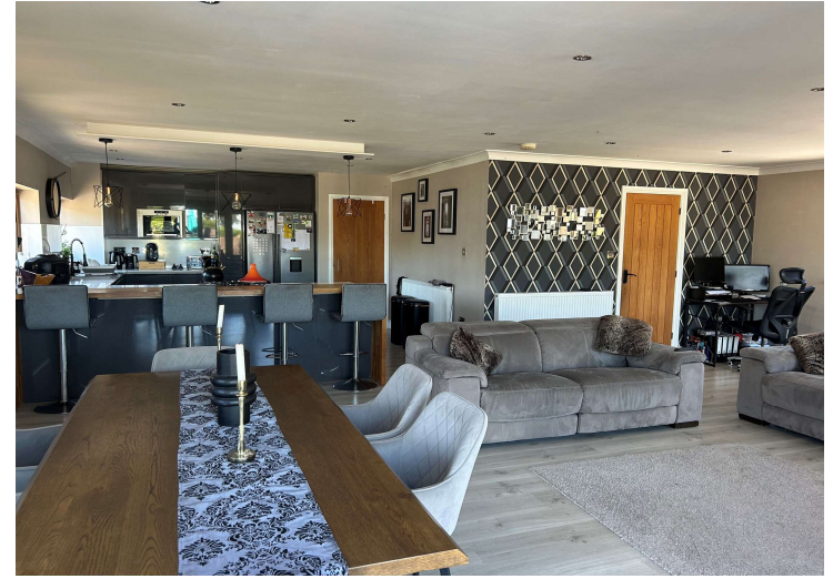
Open plan lounge / kitchen / dinner