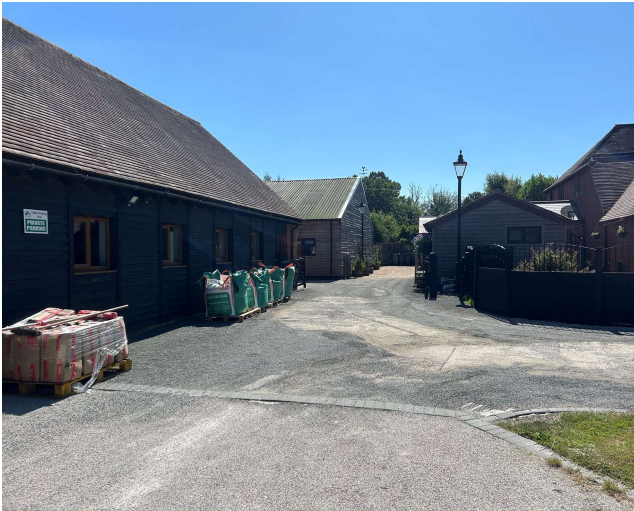
Pool building left – Ranpura right