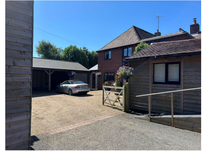
Ranpura entrance & parking