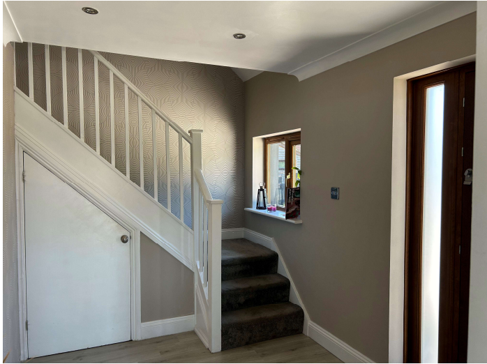
Stairs to first floor