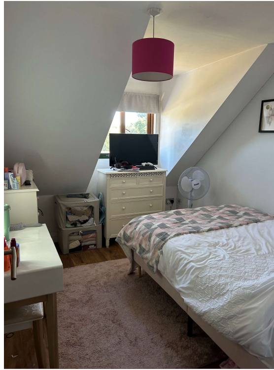
Childs bedroom 1