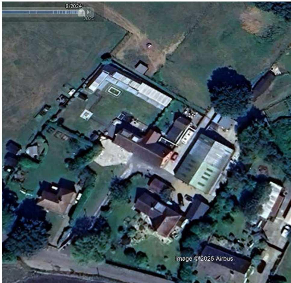
Above – August 2024 Google Earth image