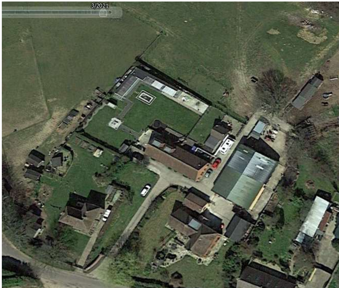
Above - March 2021 Google Earth image