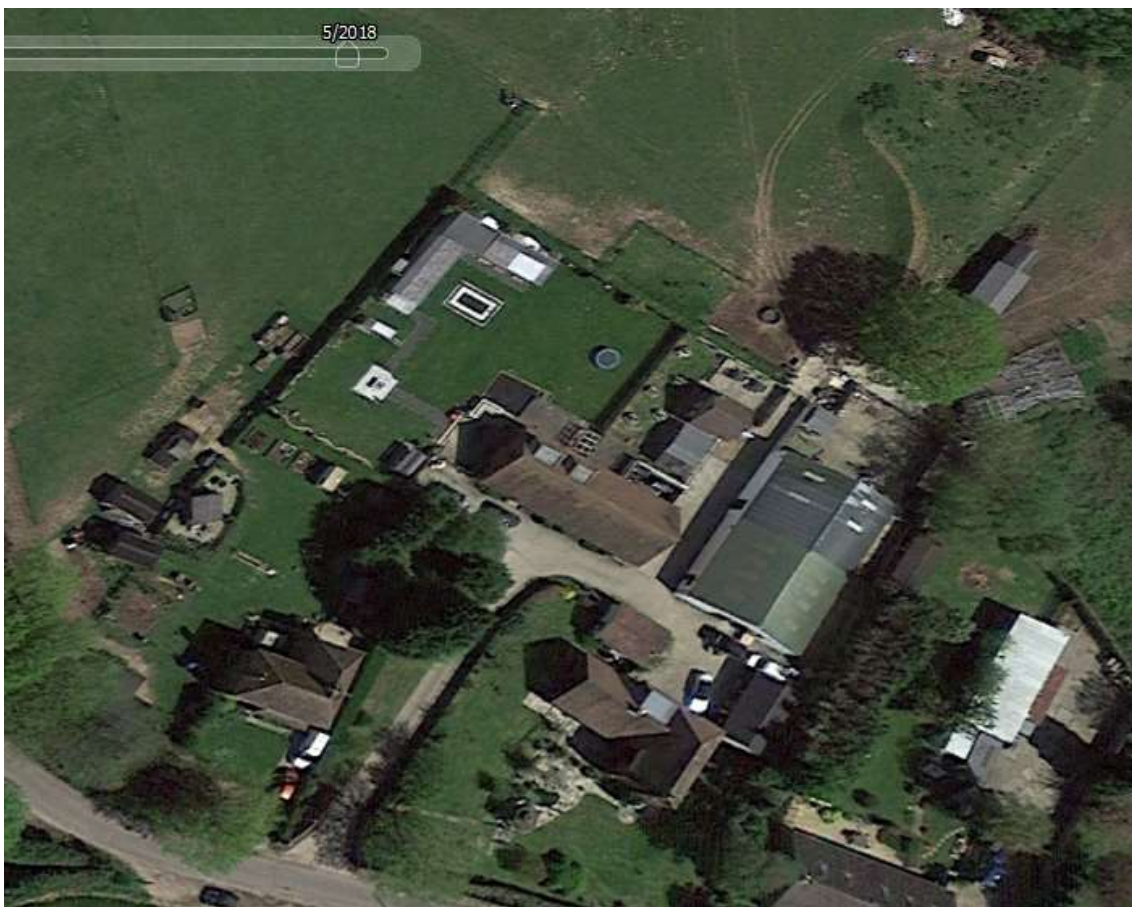
Above - May 2018 Google Earth image – the private garden is clearly defined and separated from Ranpura A trampoline is evident in the garden demonstrating occupation by a family with children