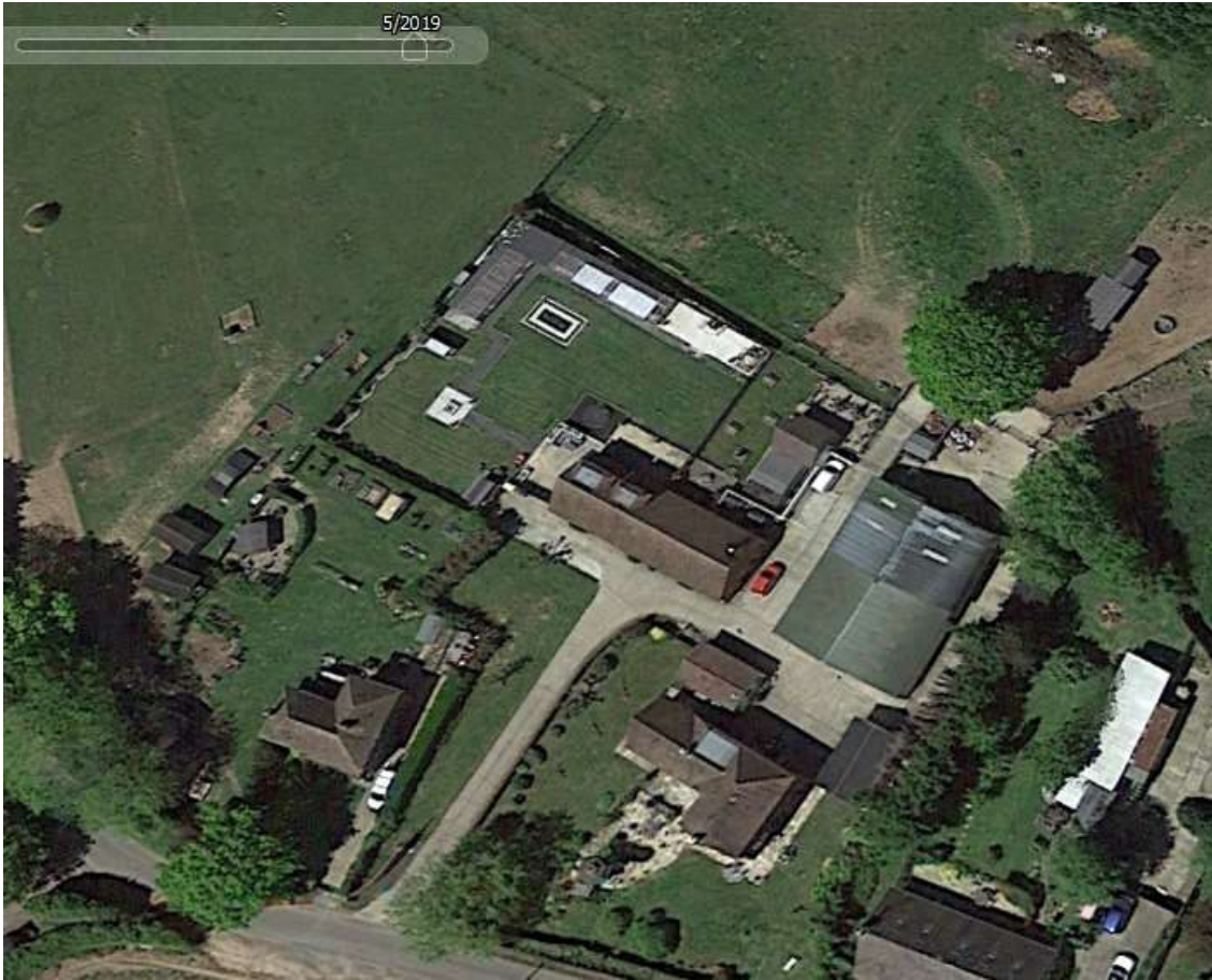
Above - May 2019 Google Earth image