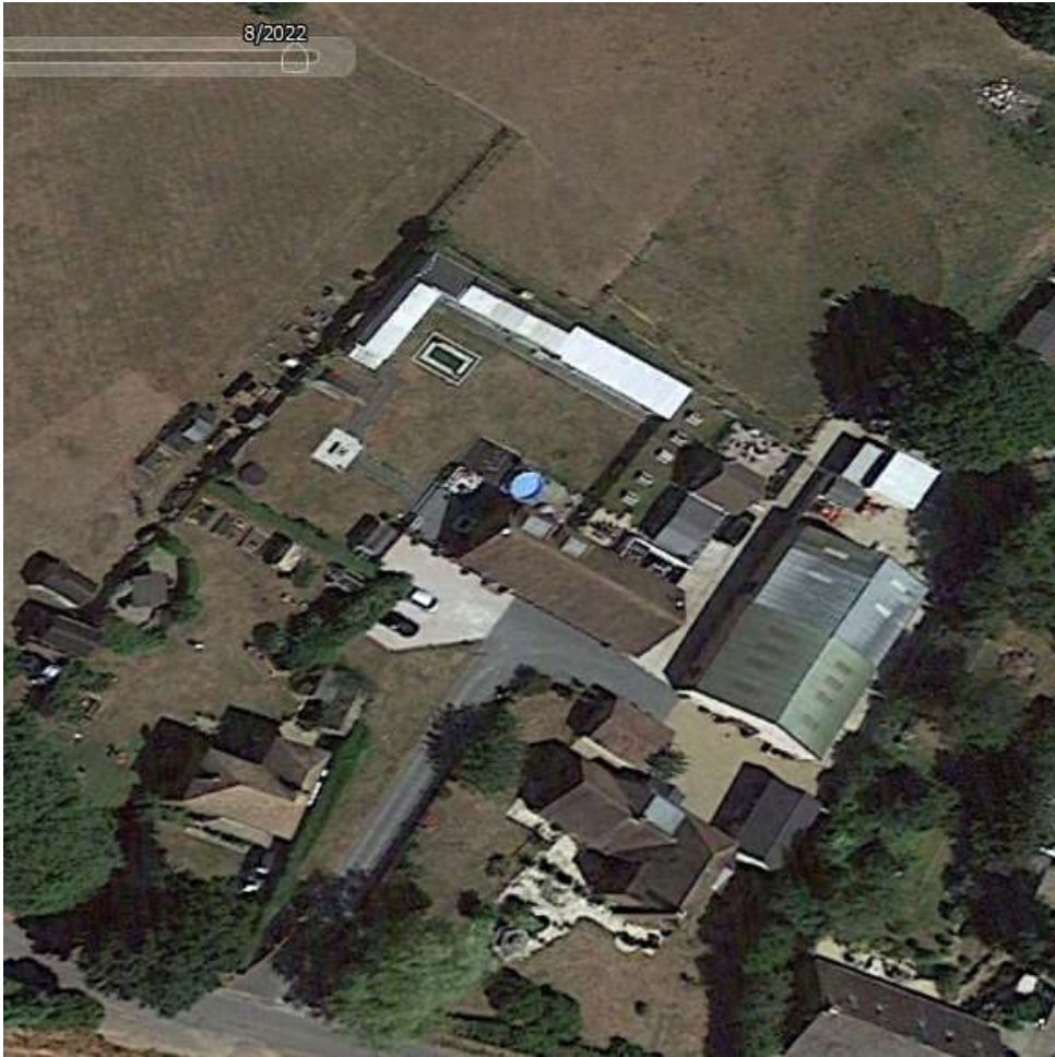
Above – August 2022 Google Earth image