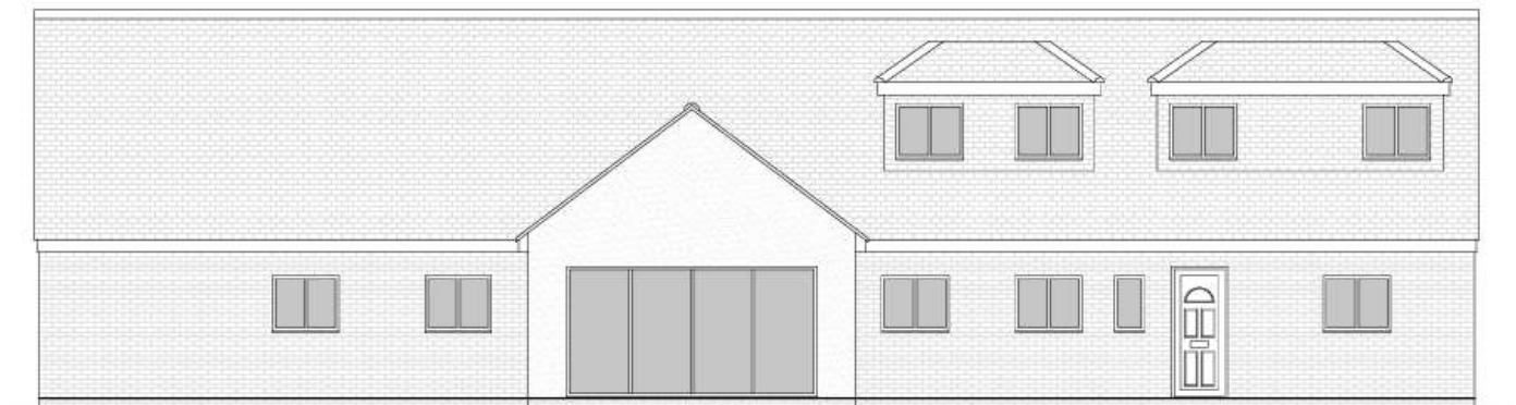
Existing rear elevation showing two large flat roof dormers installed prior to April 2015 as seen on the above Google Earth images