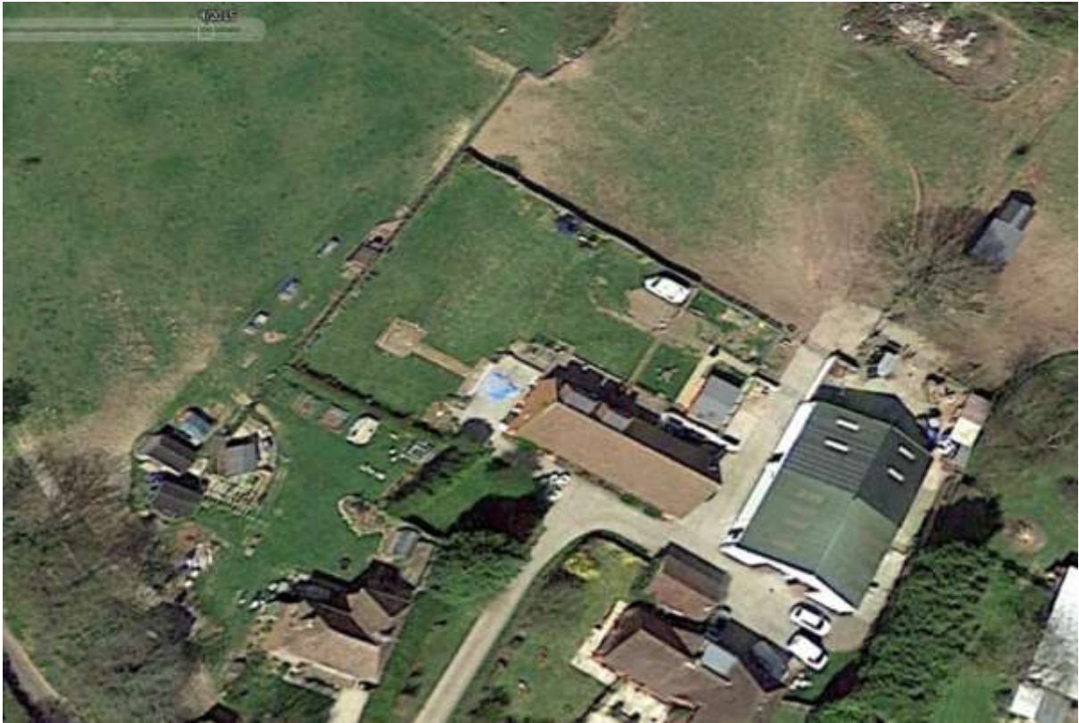
Above - April 2015 Google Earth image – Existing flat roof dormers have been installed and boundary treatment has been erected along the boundary with Ranpura creating a private garden. Patio areas installed to the north and west of The Barn. Works all carried out by the applicant / current owner to create a self-contained dwellinghouse.