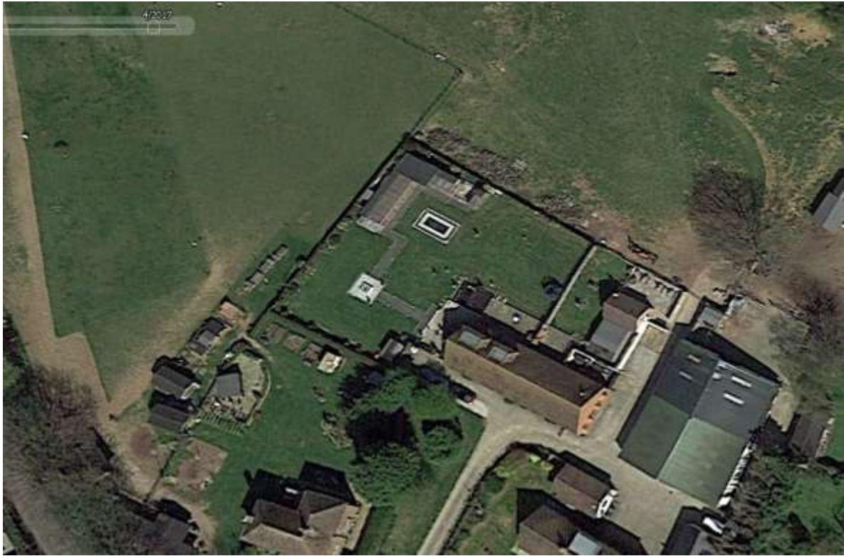
Above - April 2017 Google Earth image – Cattery buildings now installed. The boundary fence along the eastern boundary with Ranpura is clearly evident as are the patio areas to the north and west of The Barn. A self-contained dwellinghouse has been formed by creating three bedrooms at first floor level via the enlarged dormer windows, as well as a large private rear garden which has been separated from the adjoining property Ranpura.