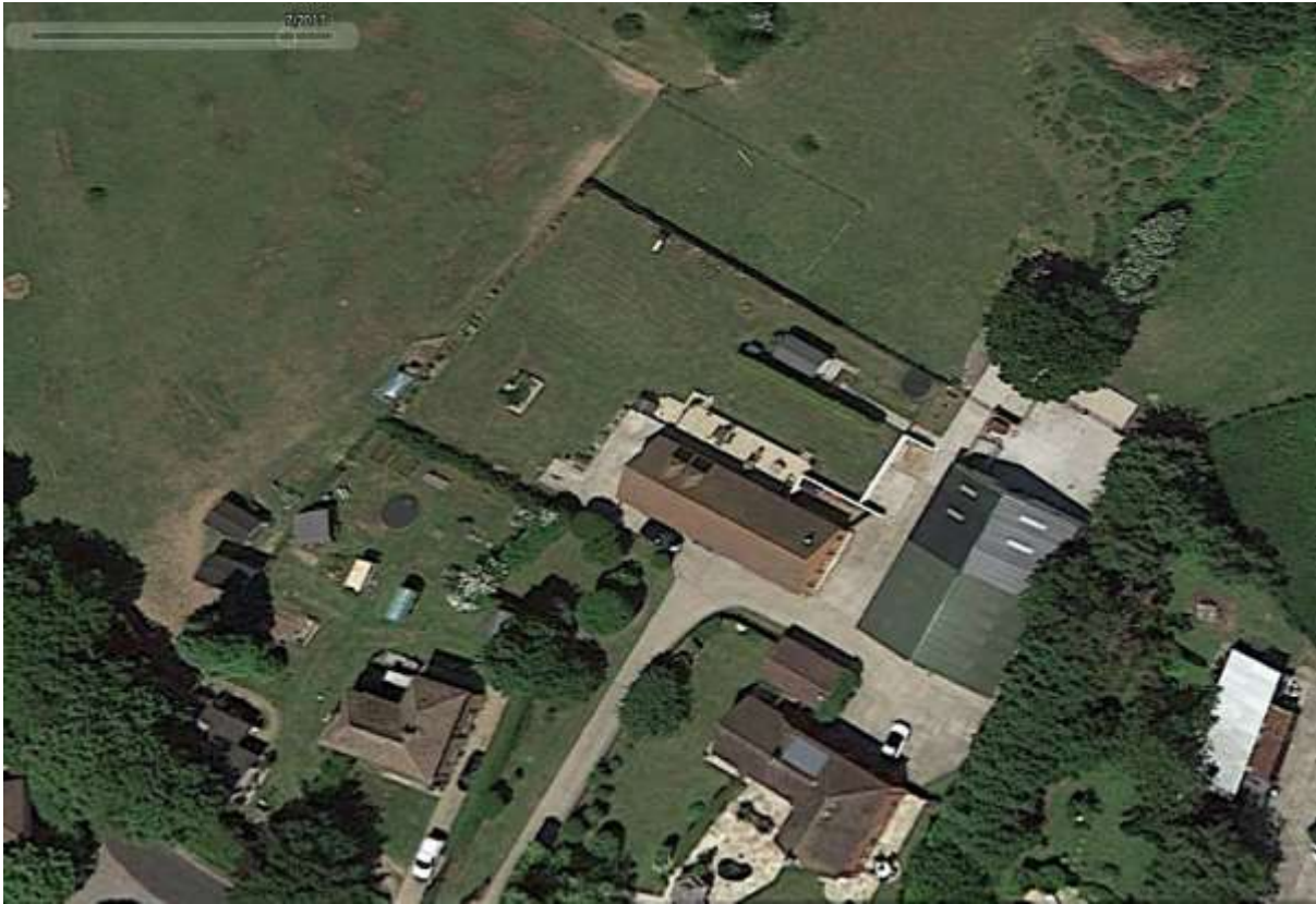
Google Earth image dated July 2013 showing the two small pitched roof dormers approved under application 05/00259