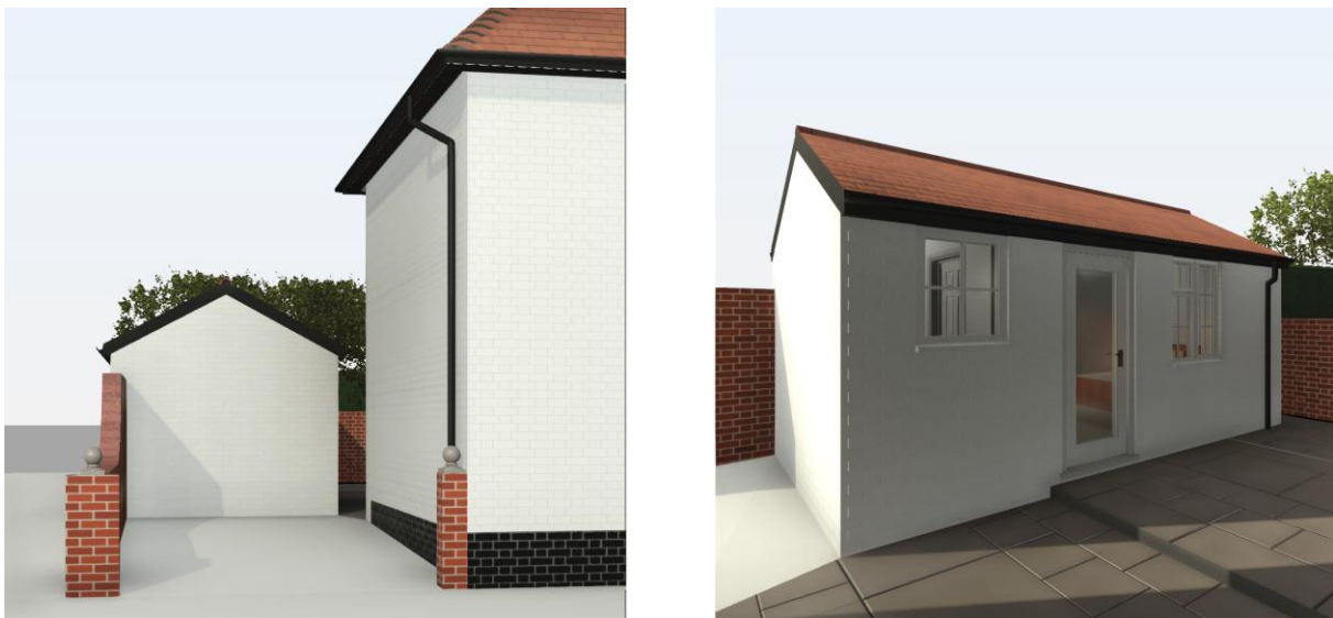
Fig. 3 Artists impression showing proposed modification to garage exterior