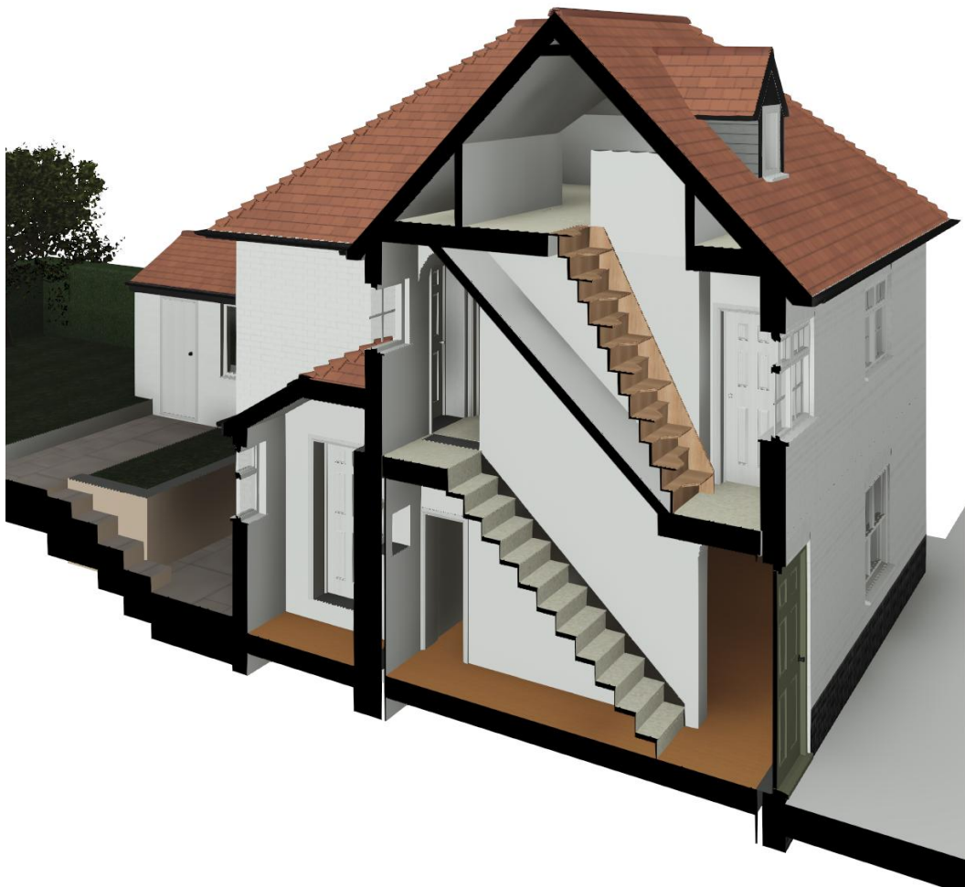
Fig. 4 Artist impression showing sectional view of proposed alternate tread staircase to loft.