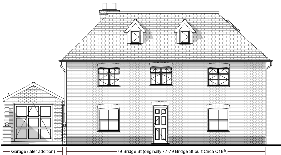
Fig. 2 Existing front elevation