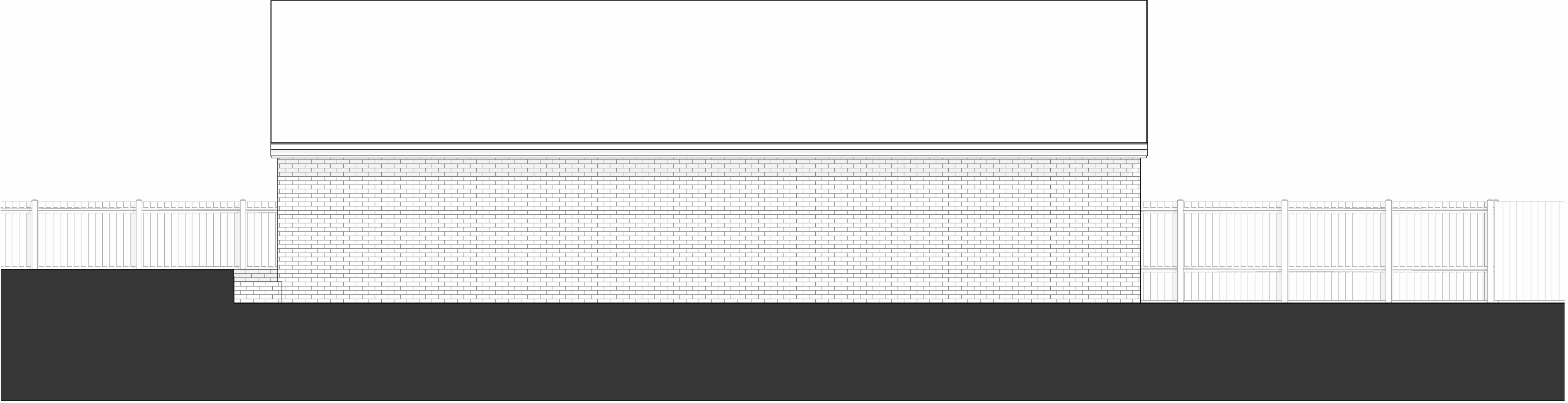
2 SIDE ELEVATION 2 1 : 50