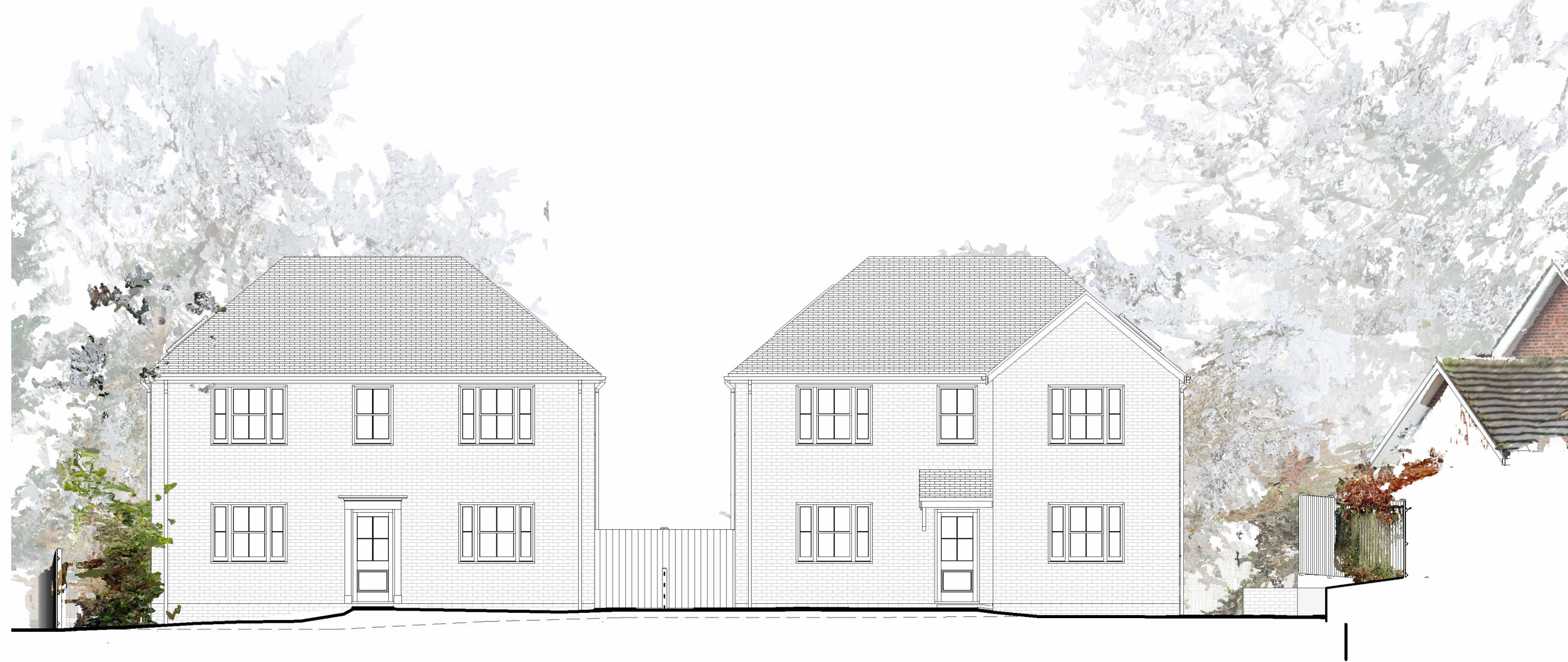
A Site Section A 1 : 100

Visuals sketch existing boundary and tree planting. Proposed landscaping proposals may differ.