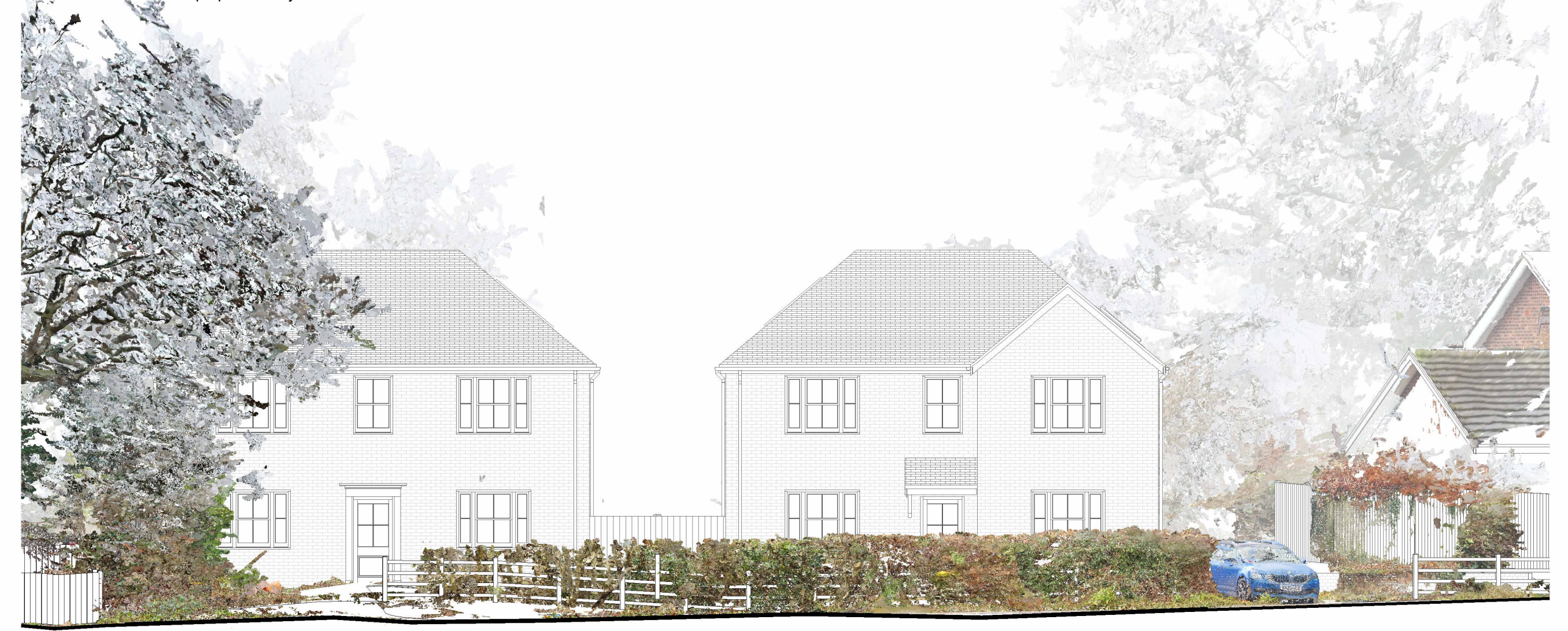
B Site Section B - Swain Road Elevation 1 : 100

Visuals sketch existing boundary and tree planting. Proposed landscaping proposals may differ.