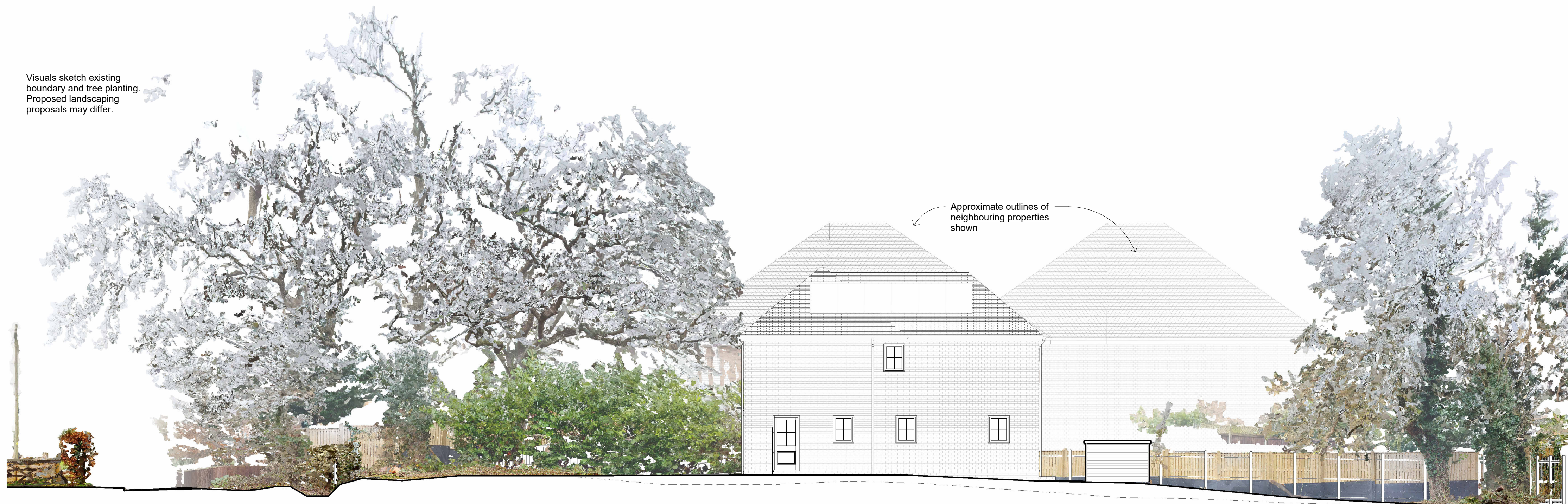
C Site Section C 1 : 100

Visuals sketch existing boundary and tree planting. Proposed landscaping proposals may differ.