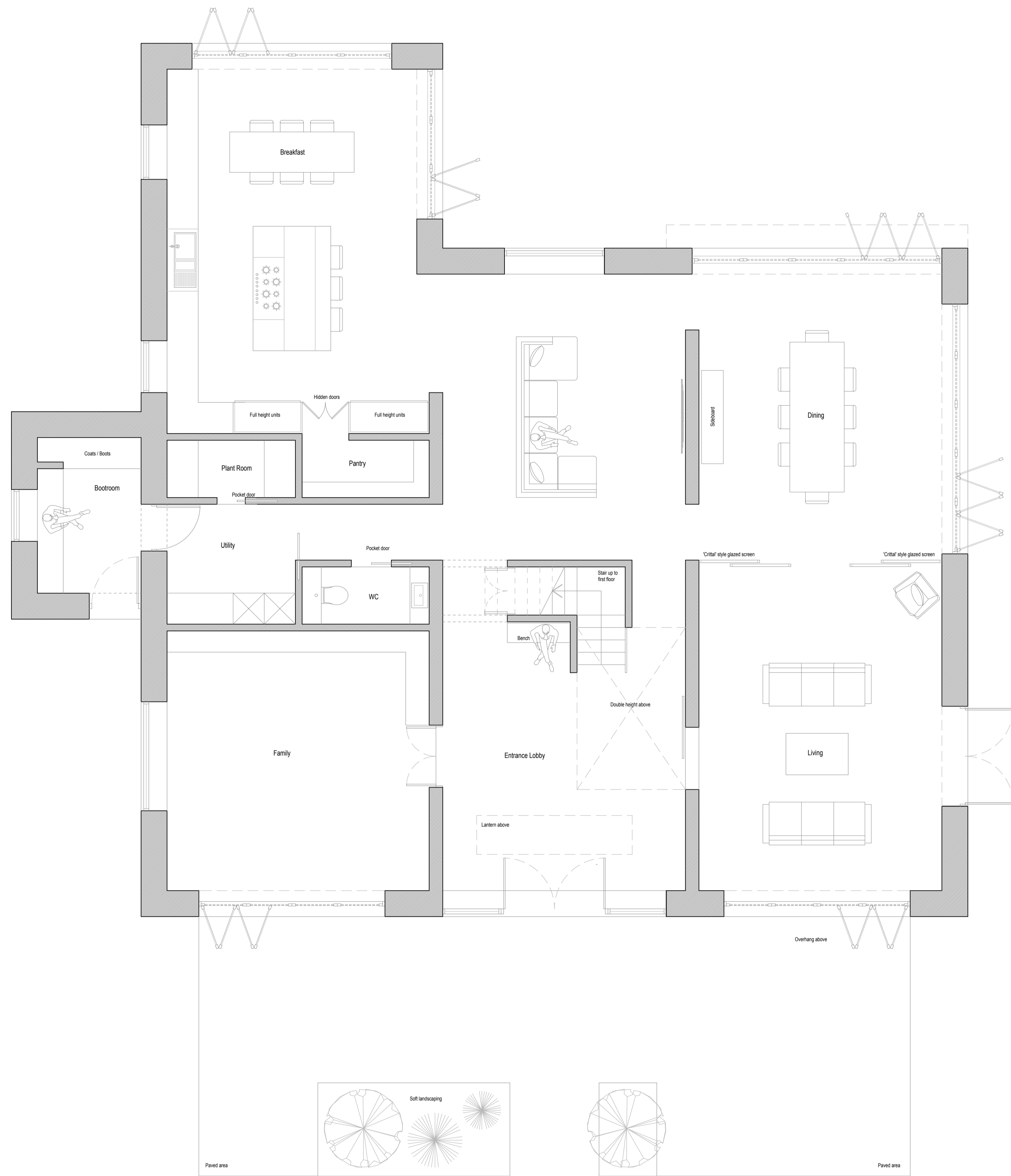
Ground Floor Plan (As Permitted) Scale 1:50