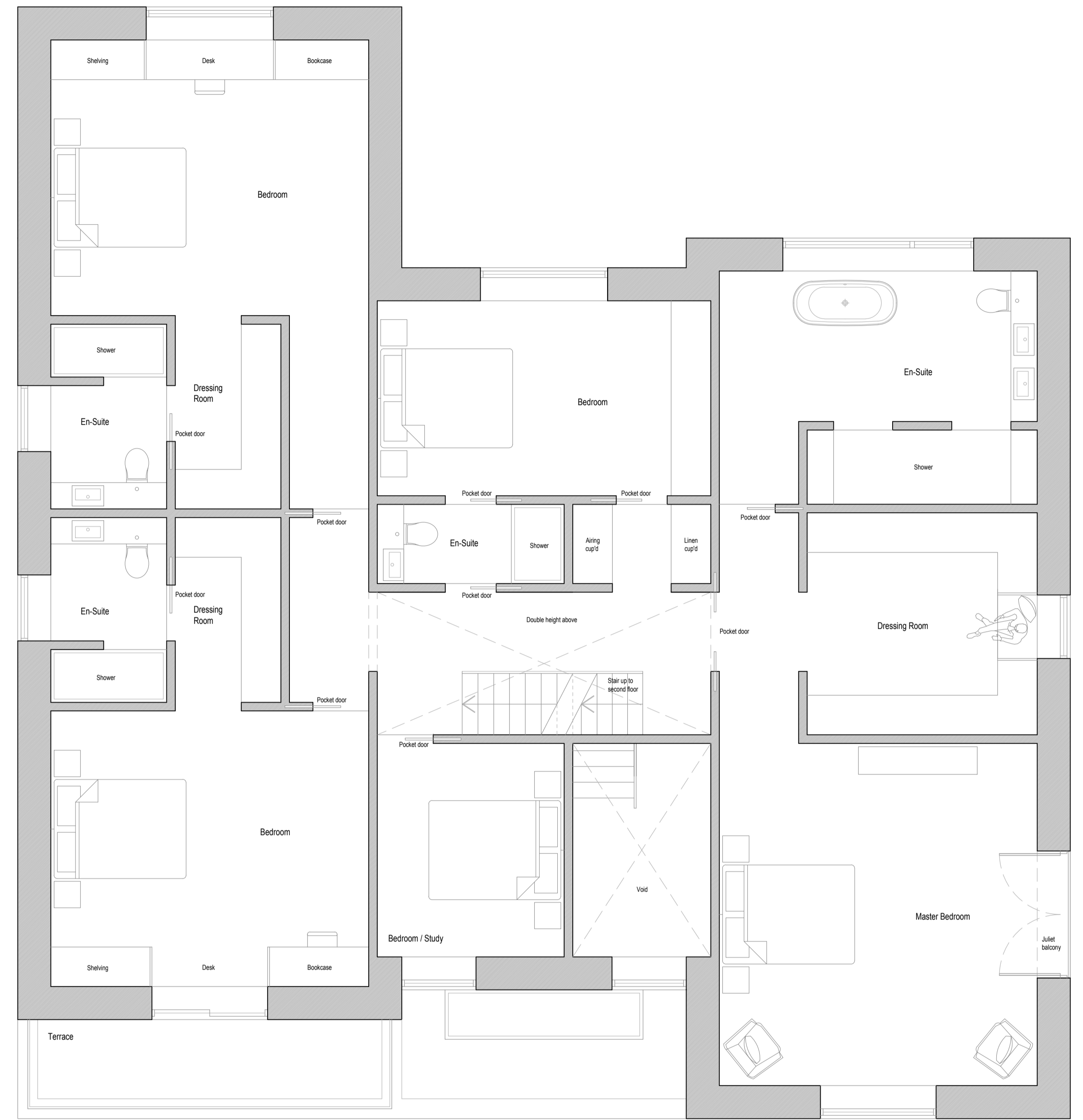
First Floor Plan (As Permitted) Scale 1:50