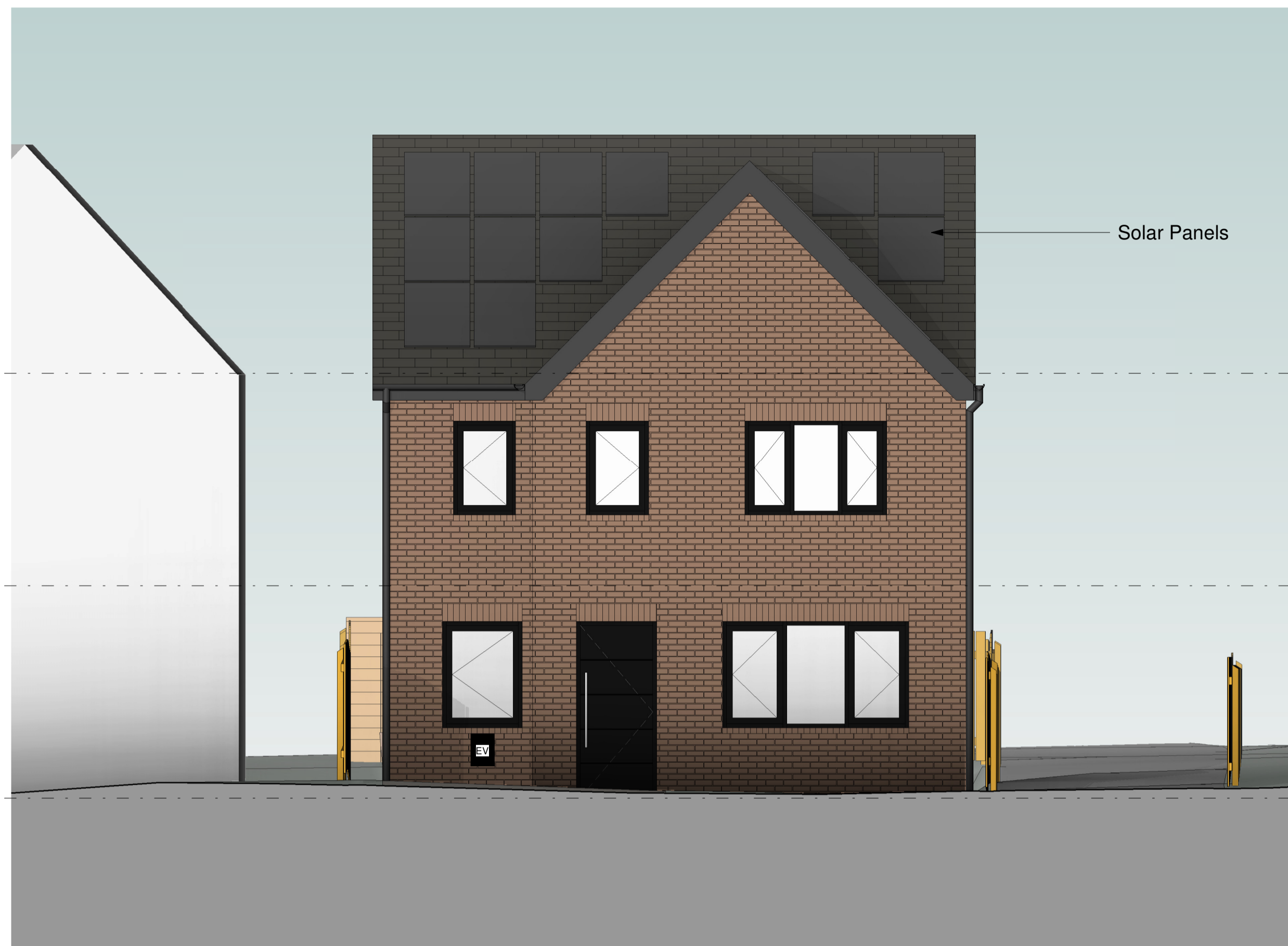
West Elevation Scale: 1 : 50