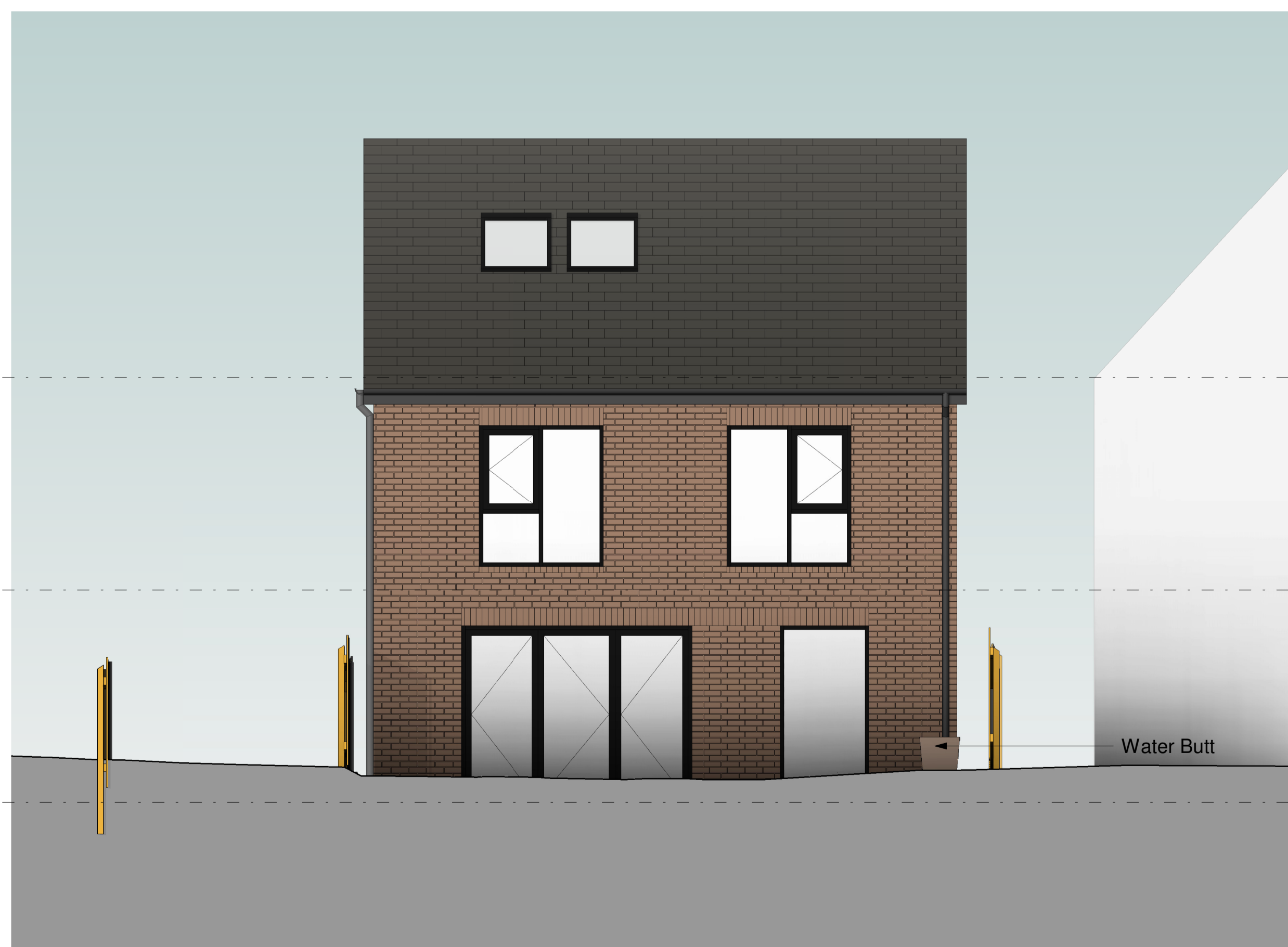
East Elevation Scale: 1 : 50