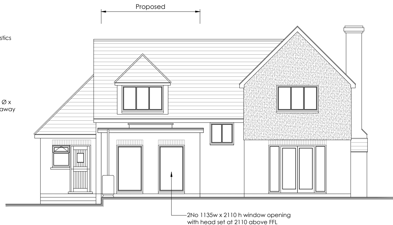
Proposed Rear Elevation scale 1:100