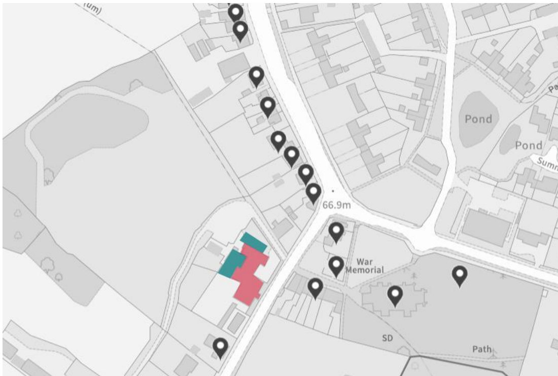
Fig 2 map showing listed buildings and application school

The application site is not listed. See the listed properties and the school (shown in red) and proposed single storey extensions (shown in teal) on the map below.