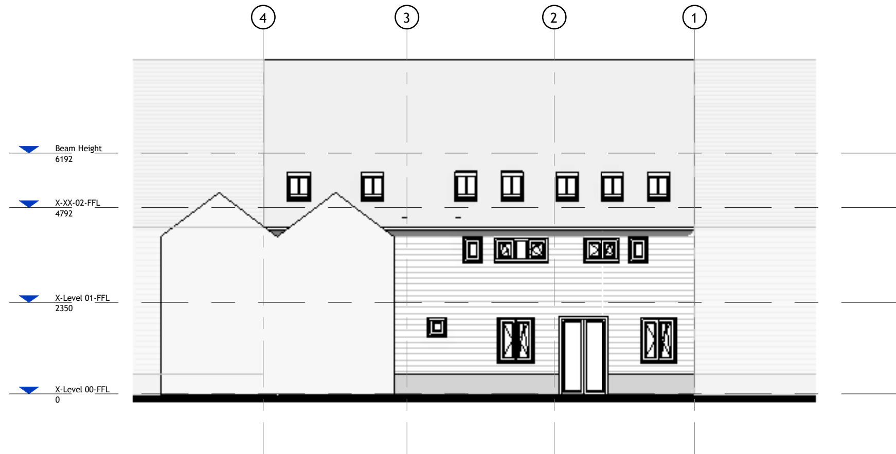
2 Existing Front Elevation 1 : 100