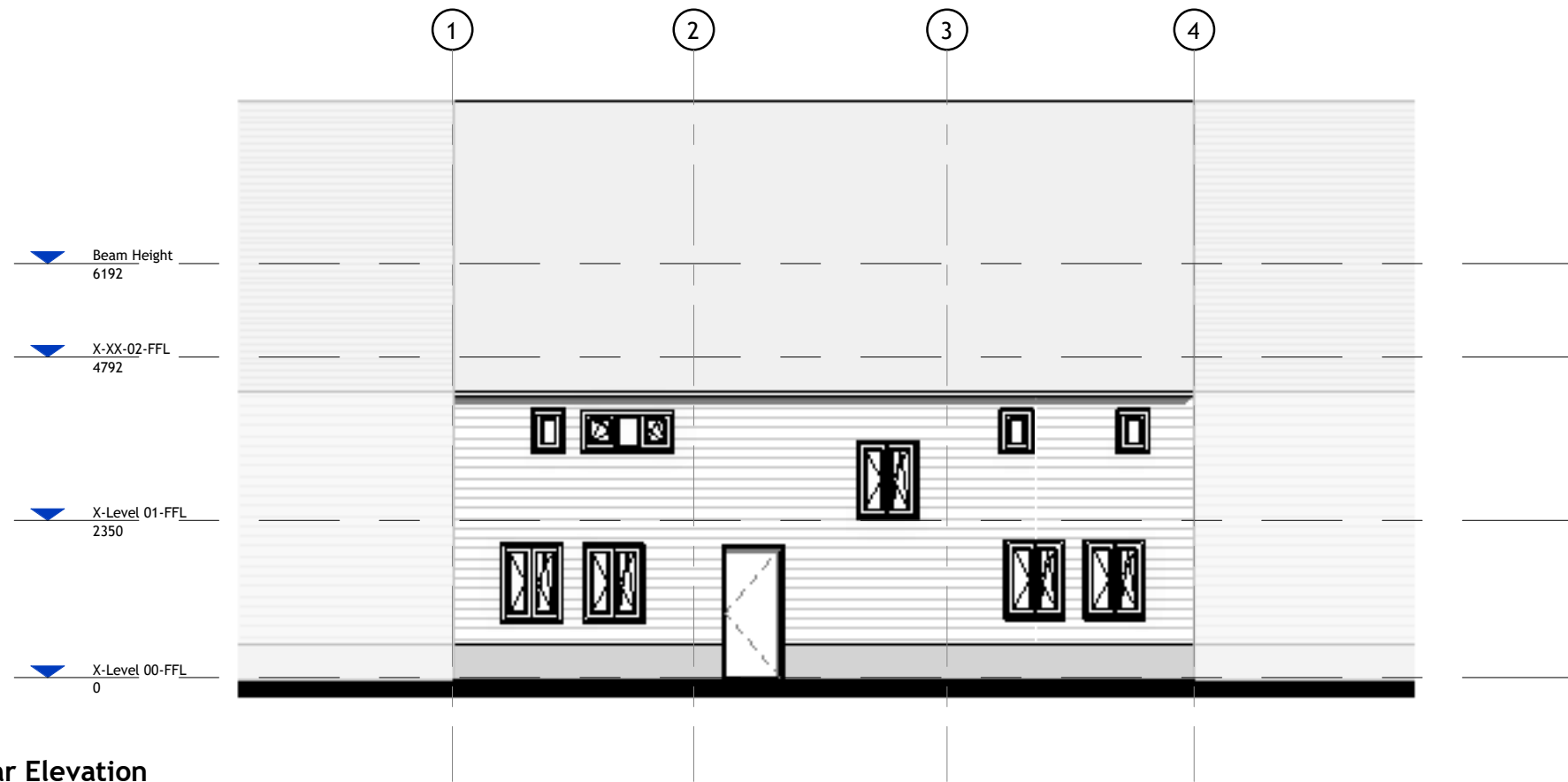
1 Existing Rear Elevation 1 : 100