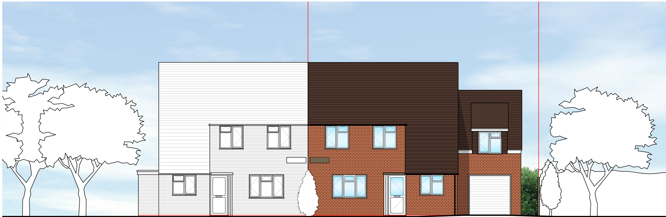
Proposed front (west) elevation Scale 1:100

Copyright Notice © 2024 Christian Lawrence Architects Ltd (CLArchitects). All rights reserved. This architectural drawing, including all design elements, specifications, and annotations, is the exclusive property of CLArchitects and is protected by copyright law. Unauthorised reproduction, distribution, or use of this drawing or any part thereof without prior written consent from CLArchitects is strictly prohibited and may result in legal action. For permissions or inquiries, please contact: CLArchitects, Unit 6, Triumph Park, Ross Way, Folkestone, CT20 3TX info@clarchitects.co.uk 01303 647233