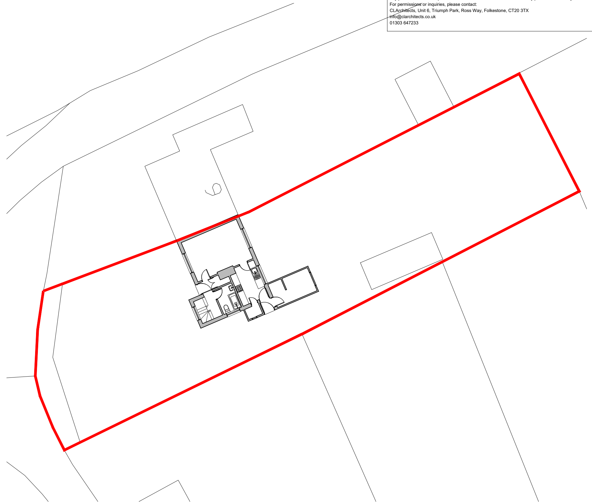
Existing site plan Scale 1:200